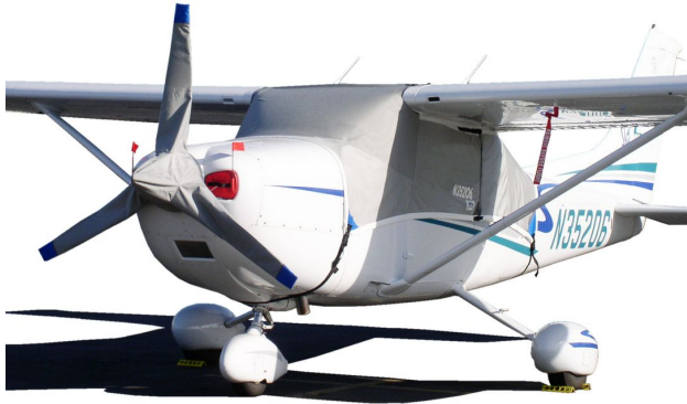
Cessna 182 Canopy Cover, Engine Plugs, 3-Blade Prop Cover

This cover type is made from Silver Acrylic Sunbrella canvas and is 100% lined with a soft and smooth microfiber. Bruce's Custom Covers developed this material combination especially for aircraft protection. The outer material is medium weight and treated for water resistance, UV resistance and anti-static buildup. The inner lining is a very soft and smooth microfiber to prevent scratching. The material is very reflective, and tests show that the cabin interior temperature can be reduced to near-ambient temperature on the hottest of days. It is water, ice and snow repellent, yet breathable to allow moisture to escape from between the cover and the aircraft surface.