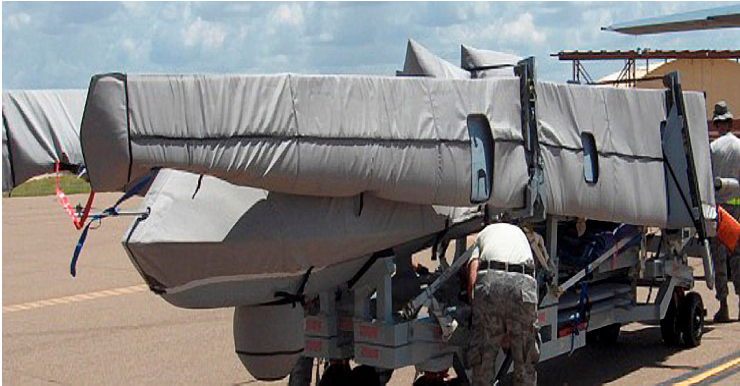
MQ1 Fuselage and Wing Covers

This cover type is made from Silver Acrylic Sunbrella canvas and is 100% lined with a soft and smooth microfiber. Bruce's Custom Covers developed this material combination especially for aircraft protection. The outer material is medium weight and treated for water resistance, UV resistance and anti-static buildup. The inner lining is a very soft and smooth microfiber to prevent scratching. The material is very reflective, and tests show that the cabin interior temperature can be reduced to near-ambient temperature on the hottest of days. It is water, ice and snow repellent, yet breathable to allow moisture to escape from between the cover and the aircraft surface.