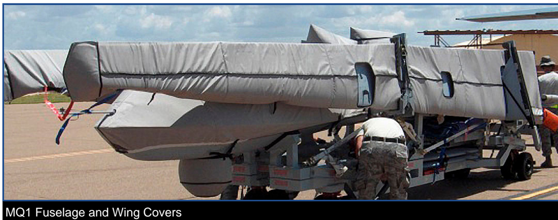
MQ1 Fuselage and Wing Covers