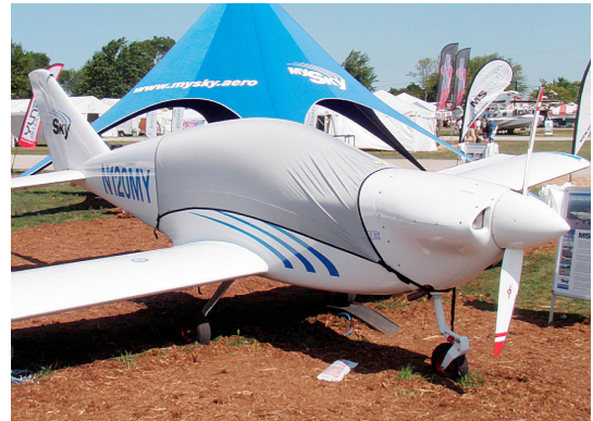
MySky Fly-Away Travel Cover