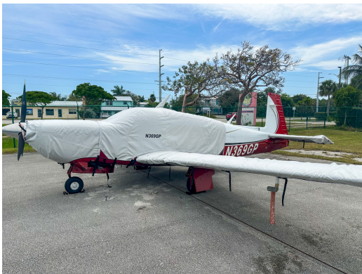
Mooney TLS/Acclaim Fully Enclosed Insulated Engine Cover, 3D model Mooney M20M Extended Canopy, Engine & Wing Covers