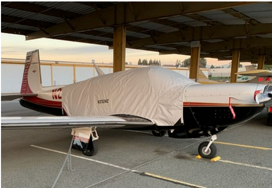
Mooney M20K Extended Canopy Cover