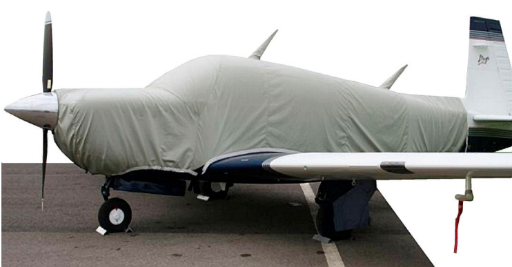
Mooney M20 Extra Extended Canopy/Engine Cover

This cover type is made from Silver Acrylic Sunbrella canvas and is 100% lined with a soft and smooth microfiber. Bruce's Custom Covers developed this material combination especially for aircraft protection. The outer material is medium weight and treated for water resistance, UV resistance and anti-static buildup. The inner lining is a very soft and smooth microfiber to prevent scratching. The material is very reflective, and tests show that the cabin interior temperature can be reduced to near-ambient temperature on the hottest of days. It is water, ice and snow repellent, yet breathable to allow moisture to escape from between the cover and the aircraft surface.