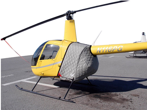
Robinson R-22 Insulated Engine Cover (also covers bottom) & Front Blade Tie-down