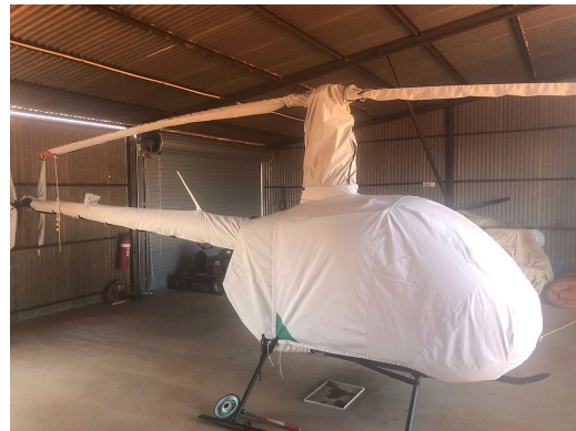
Robinson R-22 Full Cover Set