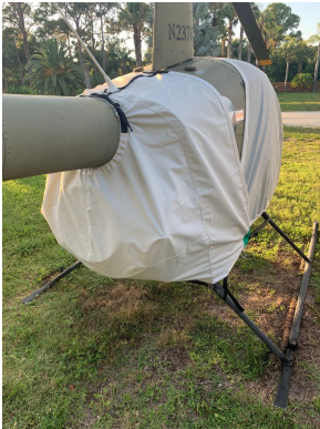
Robinson R-22 Engine Cover

Bruce's Autogyro MTO Sport, 2010, 2017 Gyrocopter Blade Covers are made of medium-weight Solution-Dyed Polyester and designed to avoid trim tabs or wicks. You can install Blade Covers from the ground with the aid of a lightweight rope attached to the open end. Covers are cinched tight at the blade root with straps and quick-release plastic buckles. The Cold Weather Blade Covers are fitted with full-length zippers and optional deice "boots" designed to accept a preheater hose; a small opening at the tip of the cover allows for some air circulation and drainage in freezing weather. Some part numbers have features for an extra charge.