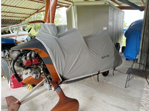
MTO Sport Travel Weight Canopy/Nose Cover

Travel Covers are made with Silver Solution-Dyed Polyester fabric and fully lined over the entire cover. The material is lightweight and more compact for easy stowage in the aircraft. The polyester material is water resistant, but only intended for occasional use outside. We also have an ultra lightweight material available for fitted hangar dust covers. For daily outdoor use, the non-travel Sunbrella Cover is the best choice.