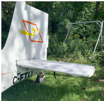
Murphy Elite Horizontal Stabilizer Covers

WINTER USE MATERIAL - Made with Solution-Dyed Polyester fabric, this option is intended for seasonal use to aid in deicing, rain mitigation, or for occasional travel. The material is lighter and more compact, but more susceptible to UV damage and may have a shorter useful life if used continuously outside than the all-year use material.