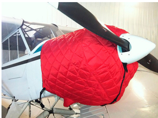
Piper Super Cub Insulated Engine Cover

This cover type is made from Silver Acrylic Sunbrella canvas and is 100% lined with a soft and smooth microfiber. Bruce's Custom Covers developed this material combination especially for aircraft protection. The outer material is medium weight and treated for water resistance, UV resistance and anti-static buildup. The inner lining is a very soft and smooth microfiber to prevent scratching. The material is very reflective, and tests show that the cabin interior temperature can be reduced to near-ambient temperature on the hottest of days. It is water, ice and snow repellent, yet breathable to allow moisture to escape from between the cover and the aircraft surface.