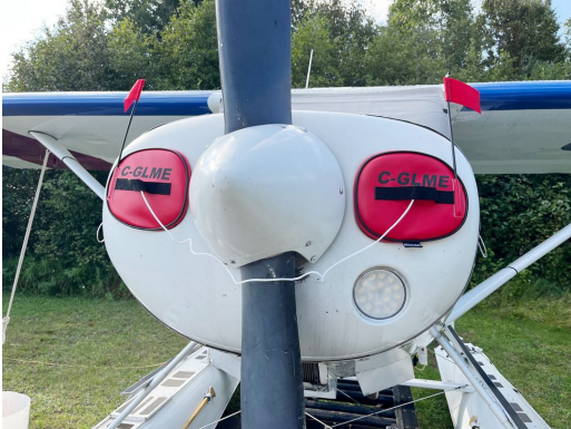
Murphy Rebel Engine Inlet Plugs

Engine Inlet Plugs are custom fit for your Murphy Rebel, Moose, Renegade, Spirit, Elite, etc. intakes, made with heavy-duty vinyl material, and stuffed with a single block of sculpted urethane foam. Each plug has a zipper that allows the foam to be removed and dried if necessary. Engine plugs have warning flags that are visible from the cockpit or 'remove before flight' streamers sewn onto the face of the plugs. Most plugs are imprinted with the aircraft registration number in black for an extra charge. Storage bag NOT included. Engine plugs may be inserted after flight when the engine is still warm. Engine Inlet Plugs are commonly referred to as Cowl Plugs, Intake Plugs, Cowl Blocks, Engine Blocks, and Engine Bungs.