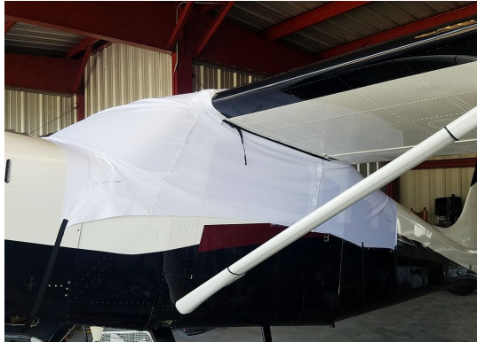
Murphy Moose Canopy Cover (test fit cover)

This cover type is made from Silver Acrylic Sunbrella canvas and is 100% lined with a soft and smooth microfiber. Bruce's Custom Covers developed this material combination especially for aircraft protection. The outer material is medium weight and treated for water resistance, UV resistance and anti-static buildup. The inner lining is a very soft and smooth microfiber to prevent scratching. The material is very reflective, and tests show that the cabin interior temperature can be reduced to near-ambient temperature on the hottest of days. It is water, ice and snow repellent, yet breathable to allow moisture to escape from between the cover and the aircraft surface.