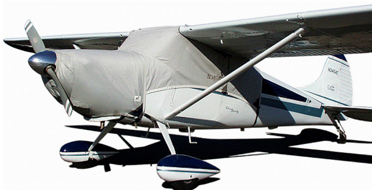
Cessna 170 Canopy Cover & Engine Cover