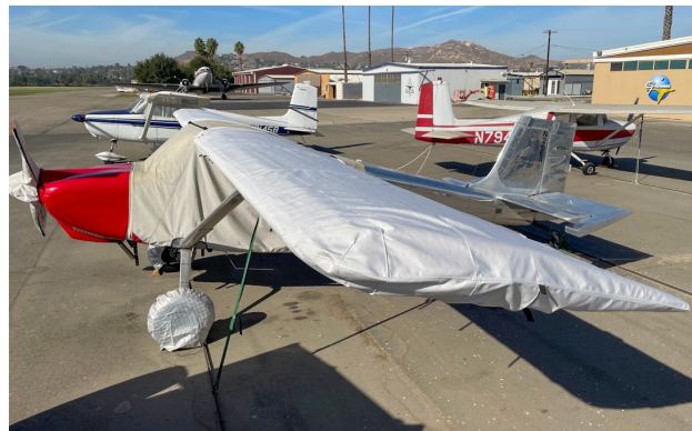
Murphy Elite Wing Covers