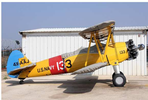
Boeing Stearman PT-13 Canopy, Wing & Horiz. Stab Covers

WINTER USE MATERIAL - Made with Solution-Dyed Polyester fabric, this option is intended for seasonal use to aid in deicing, rain mitigation, or for occasional travel. The material is lighter and more compact, but more susceptible to UV damage and may have a shorter useful life if used continuously outside than the all-year use material.