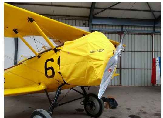
N3N Engine Cover