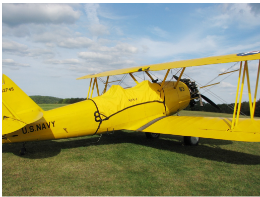
N3N Canopy Cover