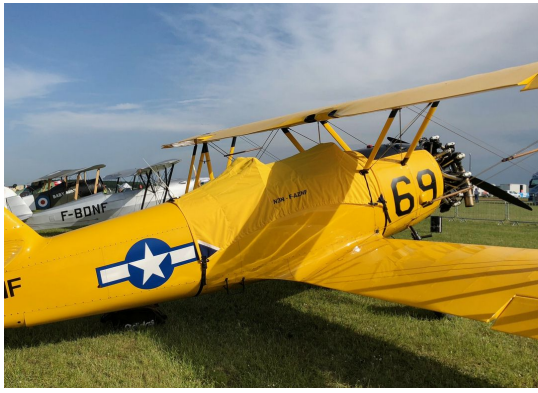
Naval Aircraft Factory N3N Canopy Cover