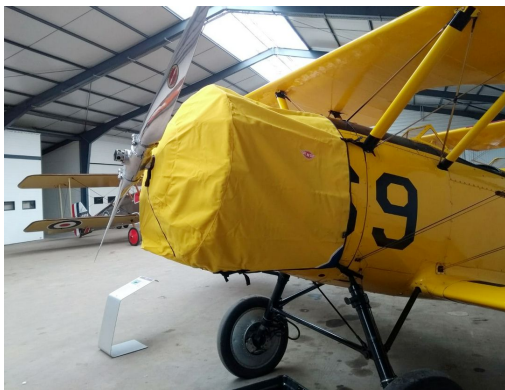
N3N Engine Cover

This cover type is made from Silver Acrylic Sunbrella canvas and is 100% lined with a soft and smooth microfiber. Bruce's Custom Covers developed this material combination especially for aircraft protection. The outer material is medium weight and treated for water resistance, UV resistance and anti-static buildup. The inner lining is a very soft and smooth microfiber to prevent scratching. The material is very reflective, and tests show that the cabin interior temperature can be reduced to near-ambient temperature on the hottest of days. It is water, ice and snow repellent, yet breathable to allow moisture to escape from between the cover and the aircraft surface.