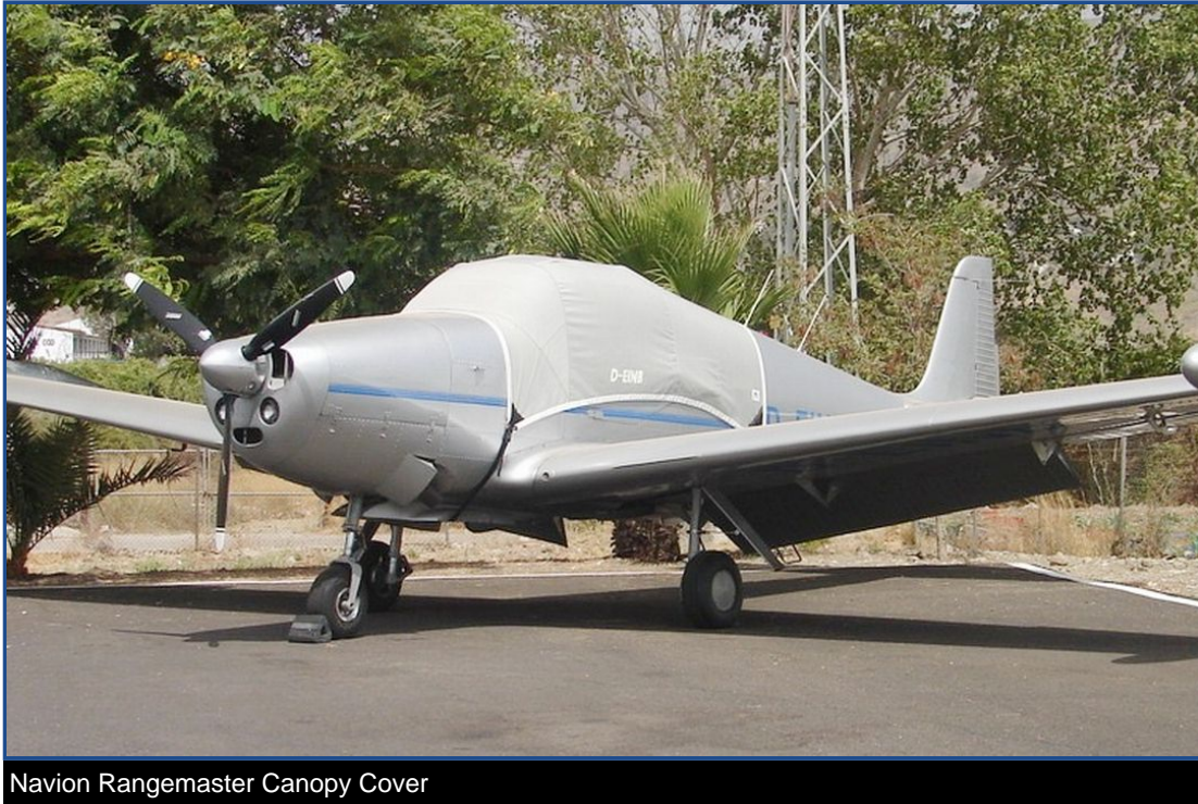
Navion Rangemaster Canopy Cover