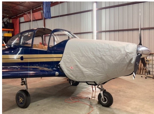
Navion Insulated Engine Cover