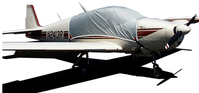
Covers & Plugs for the Navion Rangemaster