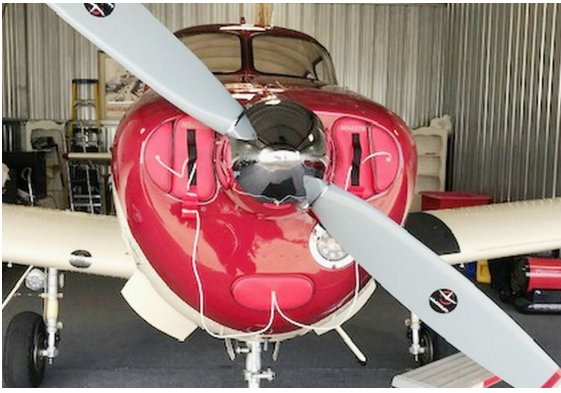
Ryan Navion B Engine Inlet Plugs