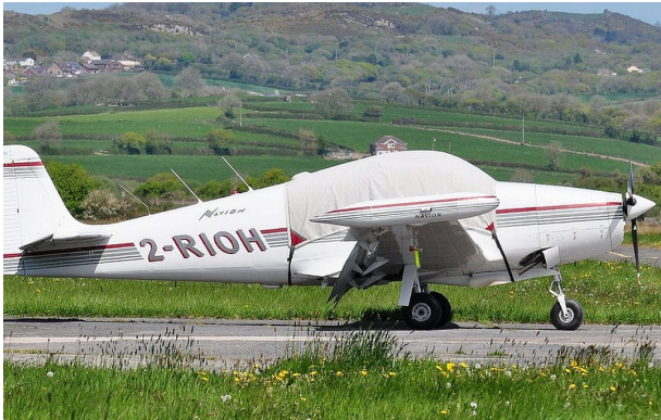
Navion Rangemaster Canopy Cover

This cover type is made from Silver Acrylic Sunbrella canvas and is 100% lined with a soft and smooth microfiber. Bruce's Custom Covers developed this material combination especially for aircraft protection. The outer material is medium weight and treated for water resistance, UV resistance and anti-static buildup. The inner lining is a very soft and smooth microfiber to prevent scratching. The material is very reflective, and tests show that the cabin interior temperature can be reduced to near-ambient temperature on the hottest of days. It is water, ice and snow repellent, yet breathable to allow moisture to escape from between the cover and the aircraft surface.