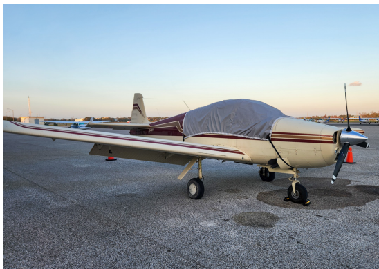
Navion Rangemaster Travel Cover, Light Weight Canopy Cover, (Super Slope windshield)