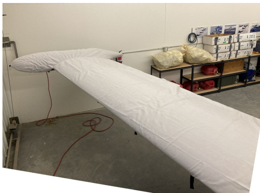
Navion Rangemaster Wing Covers

mitigation, or for occasional travel. The material is lighter and more compact, but more susceptible to UV damage and may have a shorter useful life if used continuously outside than the all-year use material.