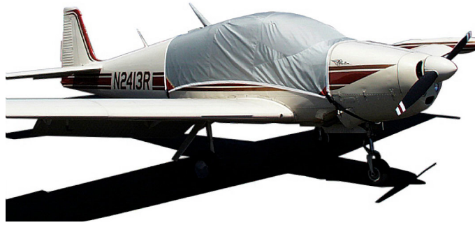
Covers & Plugs for the Navion Rangemaster