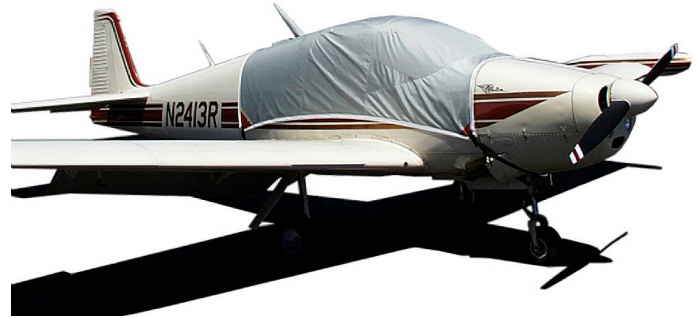
Covers & Plugs for the Navion Rangemaster