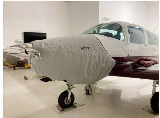
NAVION H Insulated Engine Cover