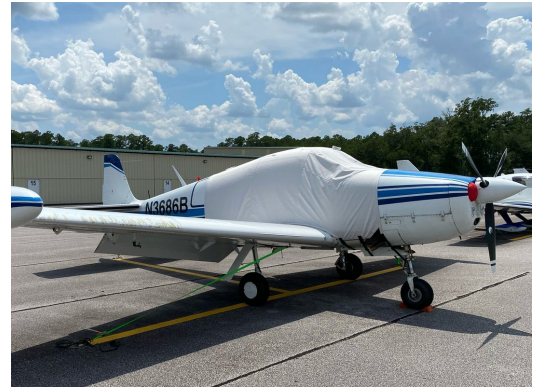
Navion Rangemaster Extended Canopy Cover