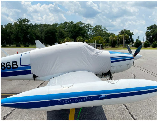
Navion Rangemaster Extended Canopy Cover

This cover type is made from Silver Acrylic Sunbrella canvas and is 100% lined with a soft and smooth microfiber. Bruce's Custom Covers developed this material combination especially for aircraft protection. The outer material is medium weight and treated for water resistance, UV resistance and anti-static buildup. The inner lining is a very soft and smooth microfiber to prevent scratching. The material is very reflective, and tests show that the cabin interior temperature can be reduced to near-ambient temperature on the hottest of days. It is water, ice and snow repellent, yet breathable to allow moisture to escape from between the cover and the aircraft surface.