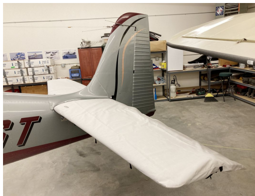
Navion Rangemaster Horizontal Stabilizer Covers