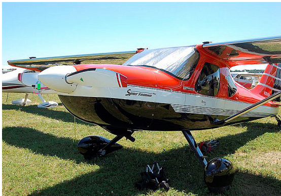
Glstar Sportsman Windshield HeatShield

Windshield Heatshields are interior sunshades for an aircraft's front windshield. The product is a unique composite of closed-cell foam with a silver mylar finish. The semi-rigid design is stiff enough to stand along the inside of the windshield using sun visors or window framing. It folds up flat and easily stores in the included storage sleeve. Some designs may require velcro and suction cups or split right and left sides. A Heatshield is an excellent short-term remedy for cockpit overheating. An external fabric cover is far more effective and practical for long-term protection.