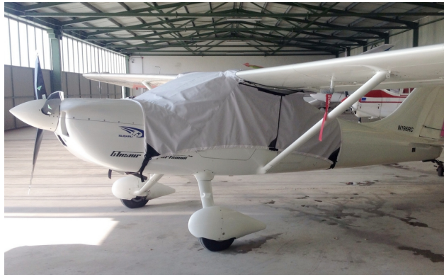
Glasair Aviation Glastar, Sportsman 2+2 Canopy Cover (Over-The-Top Style)