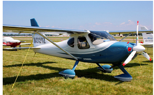
Glastar Sportsman Engine Inlet Plugs