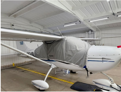
OMF Symphony Travel Cover, Light Weight Canopy Cover (Over-The-Top Style)

This cover type is made from Silver Acrylic Sunbrella canvas and is 100% lined with a soft and smooth microfiber. Bruce's Custom Covers developed this material combination especially for aircraft protection. The outer material is medium weight and treated for water resistance, UV resistance and anti-static buildup. The inner lining is a very soft and smooth microfiber to prevent scratching. The material is very reflective, and tests show that the cabin interior temperature can be reduced to near-ambient temperature on the hottest of days. It is water, ice and snow repellent, yet breathable to allow moisture to escape from between the cover and the aircraft surface.