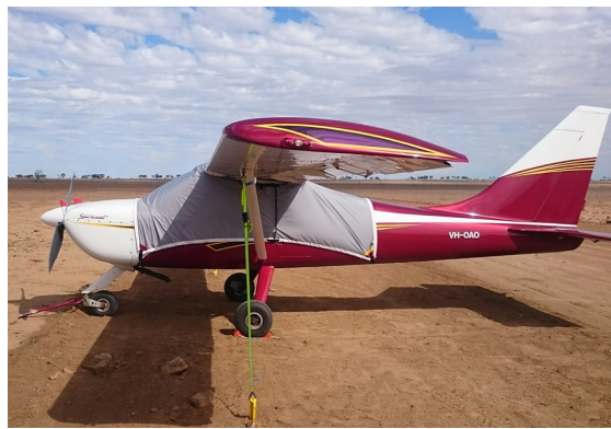
Glastar Sportsman Light Weight Travel Cover