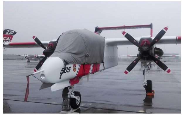
Rockwell OV-10 Canopy Cover