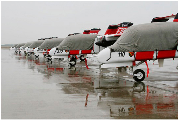
Rockwell OV-10 Canopy Covers