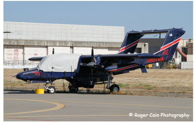
Rockwell OV-10 Bronco Canopy Cover