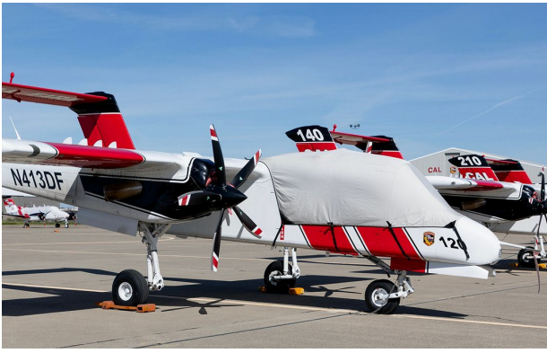
Rockwell OV-10A Bronco Cockpit Cover