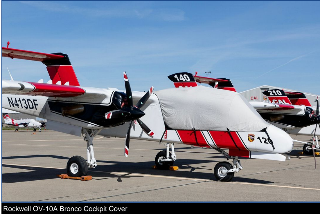
Rockwell OV-10A Bronco Cockpit Cover