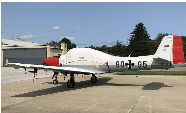
Focke Wulf F149 Canopy Cover, Wing Covers

WINTER USE MATERIAL - Made with Solution-Dyed Polyester fabric, this option is intended for seasonal use to aid in deicing, rain mitigation, or for occasional travel. The material is lighter and more compact, but more susceptible to UV damage and may have a shorter useful life if used continuously outside than the all-year use material.