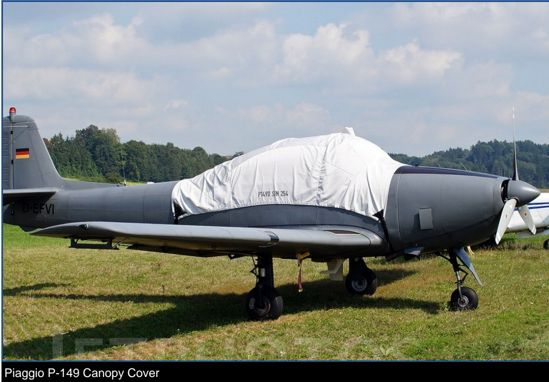
Piaggio P-149 Canopy Cover