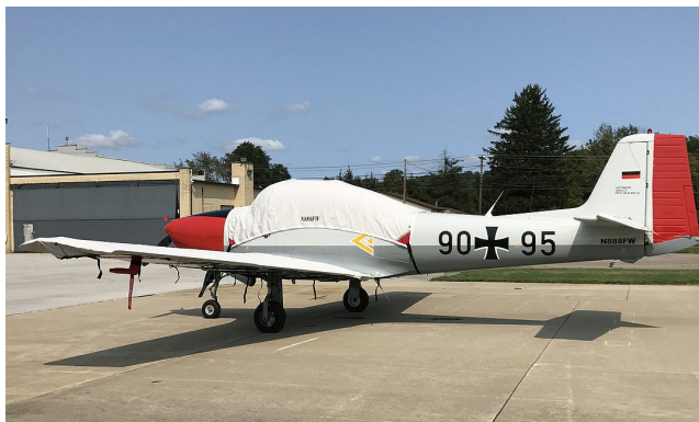
Focke Wulf F149 Canopy Cover, Wing Covers