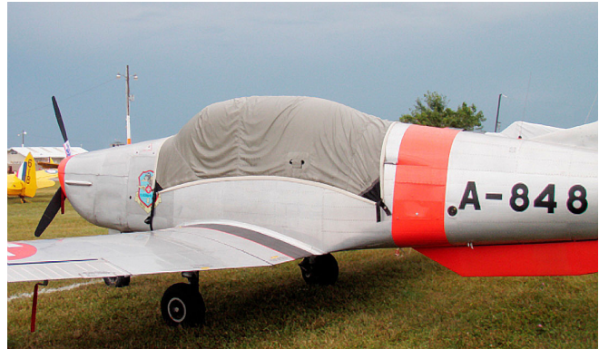
Piaggio P-149D Trainer Canopy Cover