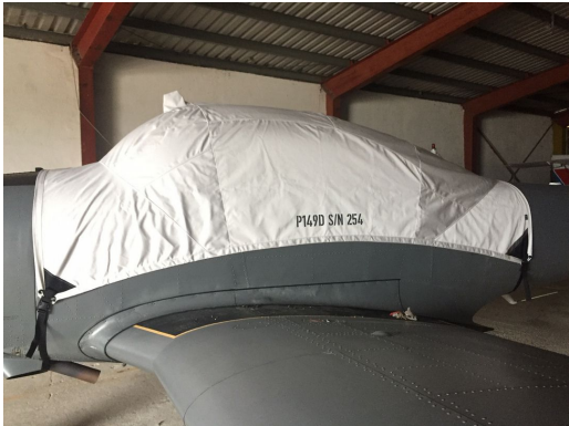
Piaggio P149D Canopy Cover

Cover and Engine Cover. This cover will enclose the engine cowl and will extend aft to cover all of the windows. This cover type is made from Silver Acrylic Sunbrella canvas and is 100% lined with a soft and smooth microfiber. Bruce's Custom Covers developed this material combination especially for aircraft protection. The outer material is medium weight and treated for water resistance, UV resistance and anti-static buildup. The inner lining is a very soft and smooth microfiber to prevent scratching. The material is very reflective, and tests show that the cabin interior temperature can be reduced to near-ambient temperature on the hottest of days. It is water, ice and snow repellent, yet breathable to allow moisture to escape from between the cover and the aircraft surface.