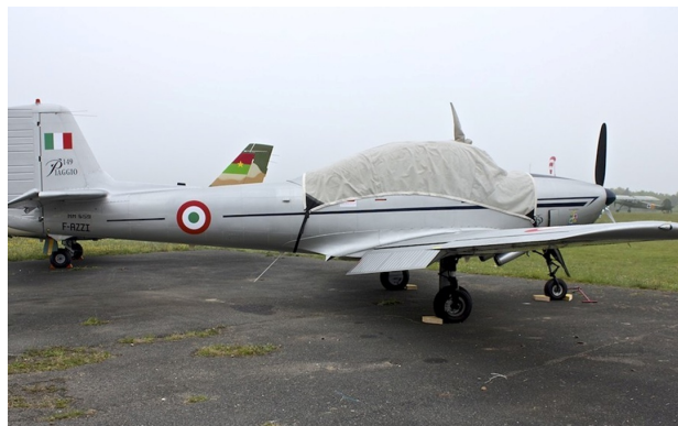
Piaggio P-149 Canopy Cover