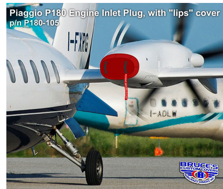
Piaggio 180 Engine Inlet Plugs with extension to cover "lips"