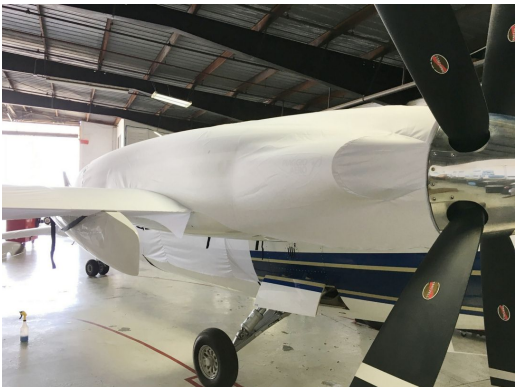
Piaggio P180 Fuselage/Canard Cover & Wing/Engine Covers (test fit covers) Piaggio P180 Fuselage/Canard Cover & Wing/Engine Covers (test fit covers)