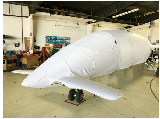
Piaggio P180 Fuselage/Canard Cover & Wing/Engine Covers (test fit covers)