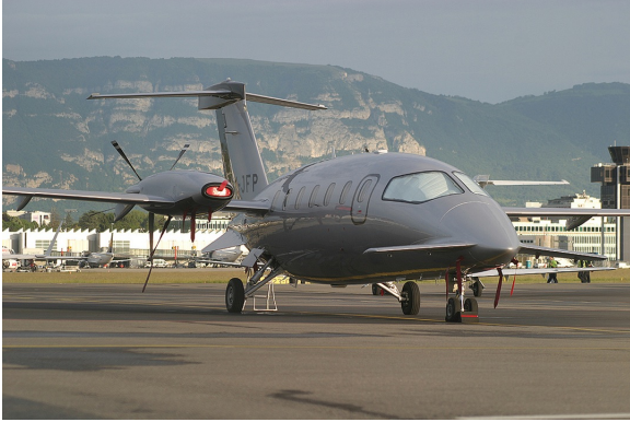
Piaggio 180 Cockpit HeatShields

Cockpit Heatshields are interior sunshades for the aircraft's cockpit. The product is a unique composite of closed-cell foam with a silver mylar finish. The semi-rigid design is stiff enough to stand inside the window framing. The set folds up flat and is easily stored in the included storage sleeve. Some designs may require velcro and suction cups. A Heatshield is an excellent short-term remedy for cockpit overheating, but an external fabric cover is more effective for long-term protection.