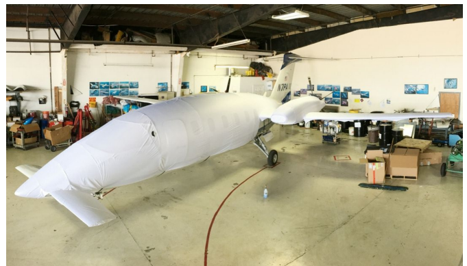
Piaggio P180 Fuselage/Canard Cover & Wing/Engine Covers (test fit covers)