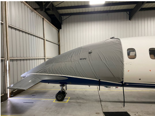
Piaggio 180 Cockpit/Nose Cover, Travel Weight