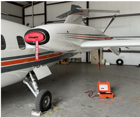
Piaggio P180 Engine Inlet Plugs

Engine Inlet Plugs are custom fit for your Piaggio Avanti P180 intakes, made with heavy-duty vinyl material, and stuffed with a single block of sculpted urethane foam. Each plug has a zipper that allows the foam to be removed and dried if necessary. Engine plugs have warning flags that are visible from the cockpit or 'remove before flight' streamers sewn onto the face of the plugs. Most plugs are imprinted with the aircraft registration number in black for an extra charge. Storage bag NOT included. Engine plugs may be inserted after flight when the engine is still warm. Engine Inlet Plugs are commonly referred to as Cowl Plugs, Intake Plugs, Cowl Blocks, Engine Blocks, and Engine Bungs.