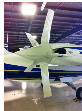
Piaggio 180 5-Blade Prop/Hub Cover