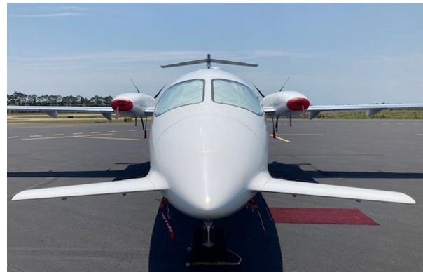
Piaggio P180 Cockpit HeatShields,