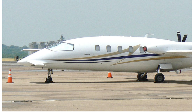
Piaggio Avanti P180 Cockpit Heatshields