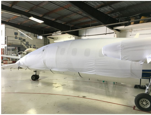
Piaggio P180 Fuselage/Canard Cover & Wing/Engine Covers (test fit covers)