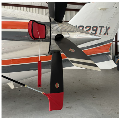
Piaggio P1080 Exhaust Covers & Prop Tie-Downs

This cover type is made from Silver Acrylic Sunbrella canvas and is 100% lined with a soft and smooth microfiber. Bruce's Custom Covers developed this material combination especially for aircraft protection. The outer material is medium weight and treated for water resistance, UV resistance and anti-static buildup. The inner lining is a very soft and smooth microfiber to prevent scratching. The material is very reflective, and tests show that the cabin interior temperature can be reduced to near-ambient temperature on the hottest of days. It is water, ice and snow repellent, yet breathable to allow moisture to escape from between the cover and the aircraft surface.