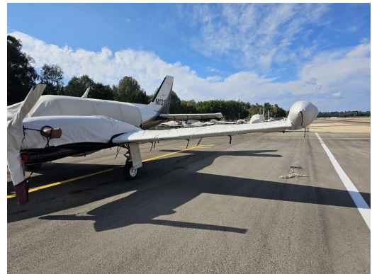
Piper PA-31T Cheyenne Canopy, Wing & Engine Covers