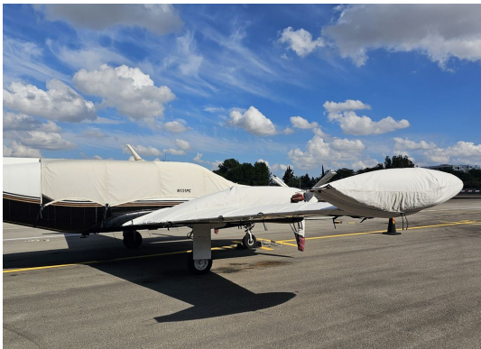
Piper PA-31T Cheyenne Canopy, Wing & Engine Covers

WINTER USE MATERIAL - Made with Solution-Dyed Polyester fabric, this option is intended for seasonal use to aid in deicing, rain mitigation, or for occasional travel. The material is lighter and more compact, but more susceptible to UV damage and may have a shorter useful life if used continuously outside than the all-year use material.