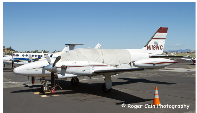
Piper PA-31T Cheyenne Canopy Cover