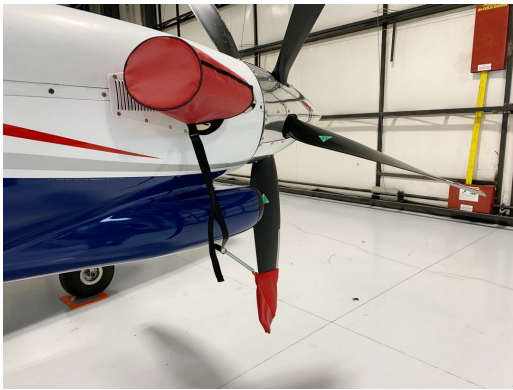
Piper PA-31T Cheyenne II Prop Tie-Downs/Exhaust Covers

This cover type is made from Silver Acrylic Sunbrella canvas and is 100% lined with a soft and smooth microfiber. Bruce's Custom Covers developed this material combination especially for aircraft protection. The outer material is medium weight and treated for water resistance, UV resistance and anti-static buildup. The inner lining is a very soft and smooth microfiber to prevent scratching. The material is very reflective, and tests show that the cabin interior temperature can be reduced to near-ambient temperature on the hottest of days. It is water, ice and snow repellent, yet breathable to allow moisture to escape from between the cover and the aircraft surface.