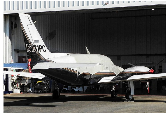
Piper Cheyenne Cockpit Cover, Engine Plugs, Prop Tie/Exhaust Covers Piper PA-31T: Cheyenne, Cheyenne II XL Canopy Cover