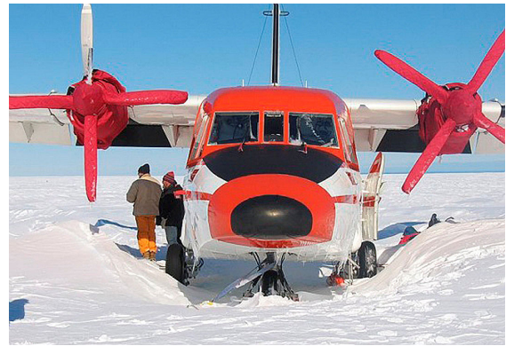
Casa 212 Insulated Engine & Propeller/Spinner Covers