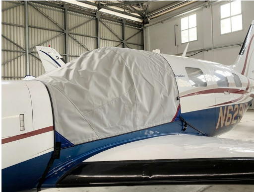
Piper PA-46-500TP Travel Cover Cockpit Cover

Travel Covers are made with Silver Solution-Dyed Polyester fabric and only lined over the windshield to save weight. The material is lightweight and more compact for easy stowage in the aircraft. The polyester material is water resistant, but only intended for occasional use outside. We also have an ultra lightweight material available for fitted hangar dust covers. For daily outdoor use, the non-travel Sunbrella Cover is the best choice.