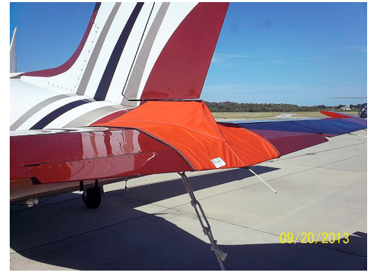
Piper Mirage, Melibu, JetProp, Meridian Tailcone Cover