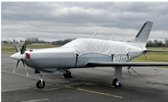
Piper PA46-350P Canopy Cover

Engine Inlet Plugs are custom fit for your Piper PA-46-350P Mirage, Matrix, JetProp intakes, made with heavy-duty vinyl material, and stuffed with a single block of sculpted urethane foam. Each plug has a zipper that allows the foam to be removed and dried if necessary. Engine plugs have warning flags that are visible from the cockpit or 'remove before flight' streamers sewn onto the face of the plugs. Most plugs are imprinted with the aircraft registration number in black for an extra charge. Storage bag NOT included. Engine plugs may be inserted after flight when the engine is still warm. Engine Inlet Plugs are commonly referred to as Cowl Plugs, Intake Plugs, Cowl Blocks, Engine Blocks, and Engine Bungs.