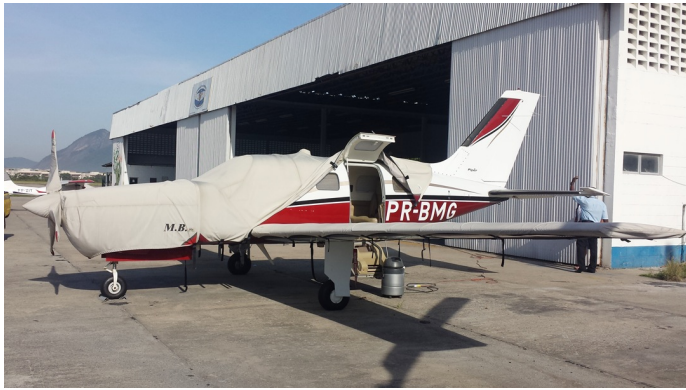
Piper Malibu/Mirage Extended Canopy Cover, Engine, Prop & Wing Covers

WINTER USE MATERIAL - Made with Solution-Dyed Polyester fabric, this option is intended for seasonal use to aid in deicing, rain mitigation, or for occasional travel. The material is lighter and more compact, but more susceptible to UV damage and may have a shorter useful life if used continuously outside than the all-year use material.