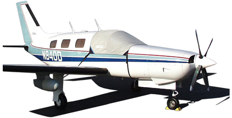
Piper Malibu/Mirage Windshield Cover