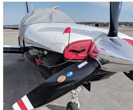
Piper PA46-350P Malibu Mirage Engine Inlet Plugs