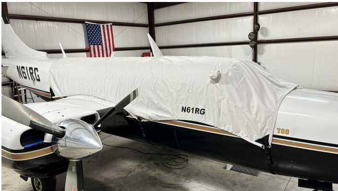
Piper Aerostar 602P Canopy Cover (Windows Only)

The Piper PA-601 Aerostar Nose Cover is designed to cover the section of the fuselage forward of the windshield to the tip of the nose. It is secured with belly straps. This cover type is made from Silver Acrylic Sunbrella canvas and is 100% lined with a soft and smooth microfiber. Bruce's Custom Covers developed this material combination especially for aircraft protection. The outer material is medium weight and treated for water resistance, UV resistance and anti-static buildup. The inner lining is a very soft and smooth microfiber to prevent scratching. The material is very reflective, and tests show that the cabin interior temperature can be reduced to near-ambient temperature on the hottest of days. It is water, ice and snow repellent, yet breathable to allow moisture to escape from between the cover and the aircraft surface.