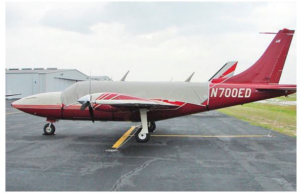
Piper Aerostar Canopy Cover, extended over baggage door