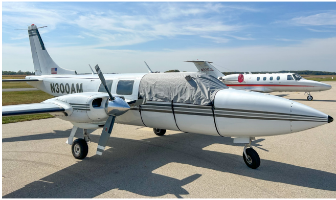
AEROSTAR 601P Travel Cover, Light Weight Travel Cockpit/Skylights Cover