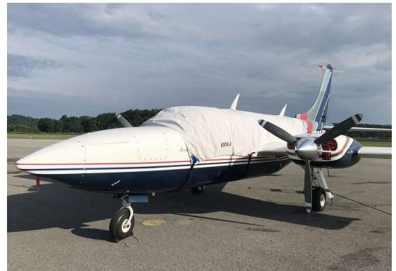
Smith Aerostar 600 Canopy Cover