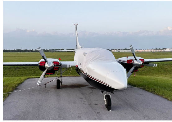
Piper PA-601 Aerostar Canopy Cover (Windows Only), Engine Plugs