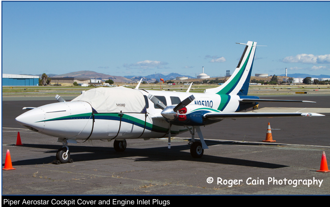
Piper Aerostar Cockpit Cover and Engine Inlet Plugs