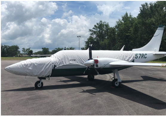
Piper Aerostar Canopy & Nose Covers, Engine Plugs