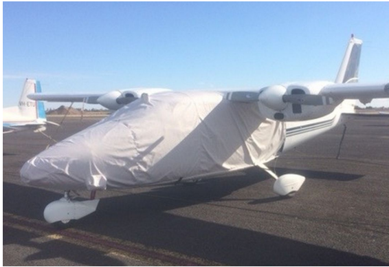
Partenavia, Vulcanair P-68C & P-68R Canopy/Nose Cover, Wrap-Around

The material is very reflective, and tests show that the cabin interior temperature can be reduced to near-ambient temperature on the hottest of days. It is water, ice and snow repellent, yet breathable to allow moisture to escape from between the cover and the aircraft surface.