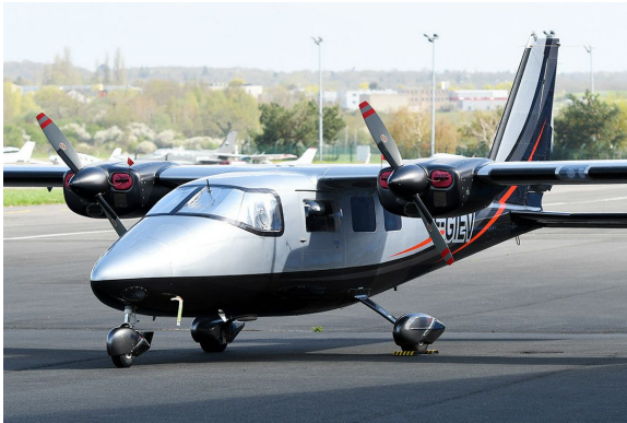
Partenavia P68c Cockpit HeatShields, Engine Plugs

Engine Inlet Plugs are custom fit for your Partenavia, Vulcanair P-68C & P-68R intakes, made with heavy-duty vinyl material, and stuffed with a single block of sculpted urethane foam. Each plug has a zipper that allows the foam to be removed and dried if necessary. Engine plugs have warning flags that are visible from the cockpit or 'remove before flight' streamers sewn onto the face of the plugs. Most plugs are imprinted with the aircraft registration number in black for an extra charge. Storage bag NOT included. Engine plugs may be inserted after flight when the engine is still warm. Engine Inlet Plugs are commonly referred to as Cowl Plugs, Intake Plugs, Cowl Blocks, Engine Blocks, and Engine Bungs.