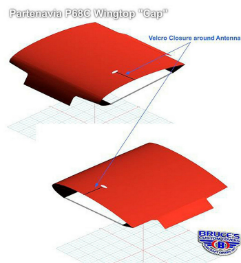
Partenavia Wing "Cap"

WINTER USE MATERIAL - Made with Solution-Dyed Polyester fabric, this option is intended for seasonal use to aid in deicing, rain mitigation, or for occasional travel. The material is lighter and more compact, but more susceptible to UV damage and may have a shorter useful life if used continuously outside than the all-year use material.