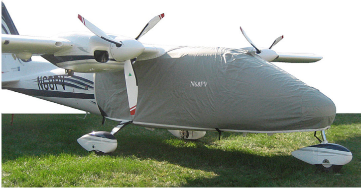
Partenavia Observer Canopy/Bubble Cover