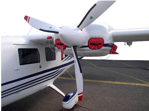
Observer Engine Plugs