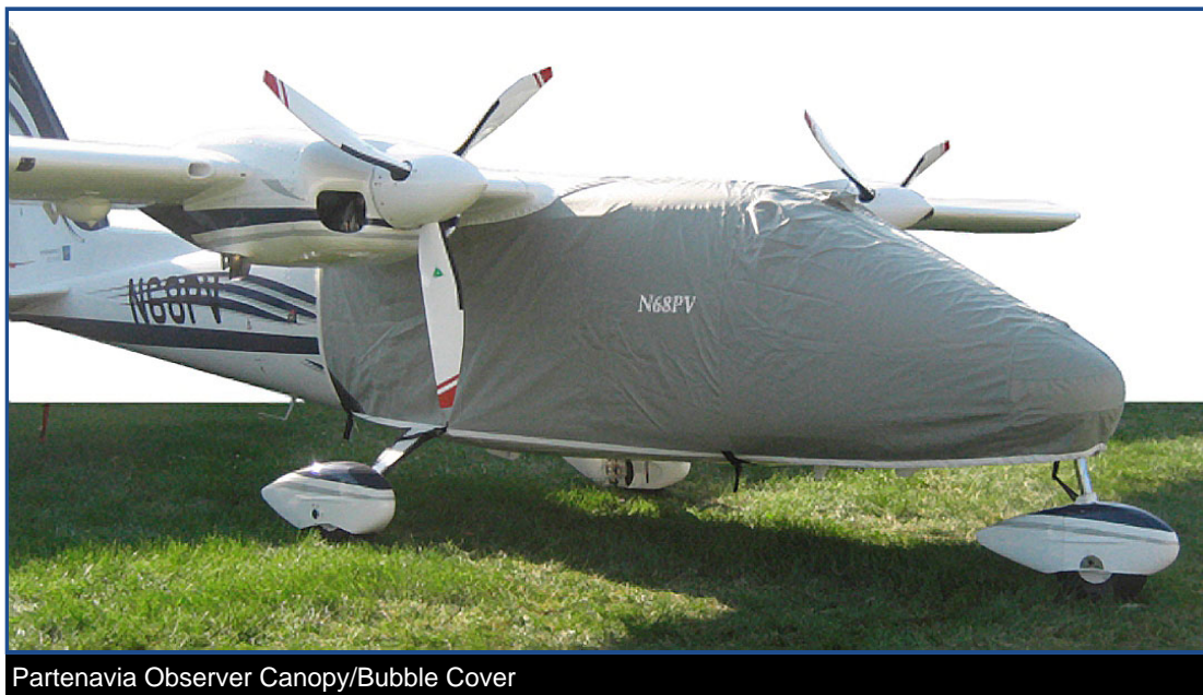
Partenavia Observer Canopy/Bubble Cover