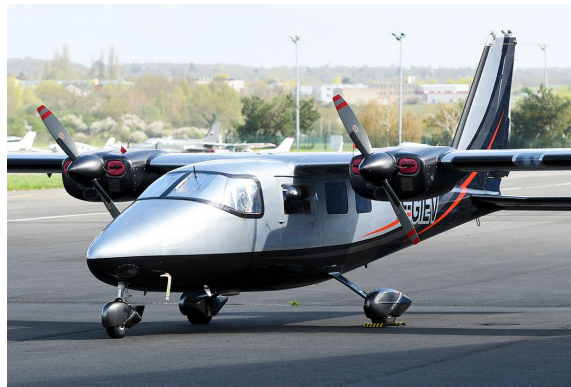
Partenavia P68c Cockpit HeatShields, Engine Plugs

Heatshields are interior sunshades for an aircraft's windows or canopy glass. The product is a unique composite of closed-cell foam with a silver mylar finish. The semi-rigid design is stiff enough to stand along the inside of the windshield using sun visors or window framing. It folds up flat and easily stores in the included storage sleeve. Some designs may require velcro and suction cups. A Heatshield is an excellent short-term remedy for cockpit overheating.