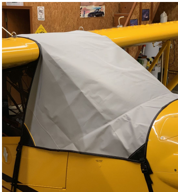
Cub Crafters Carbon Cub FX3 Windshield/Skylight Cover, travel weight