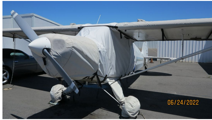
Piper PA-12 Over-Top Canopy Cover, Engine, Wing & Landing Gear Covers