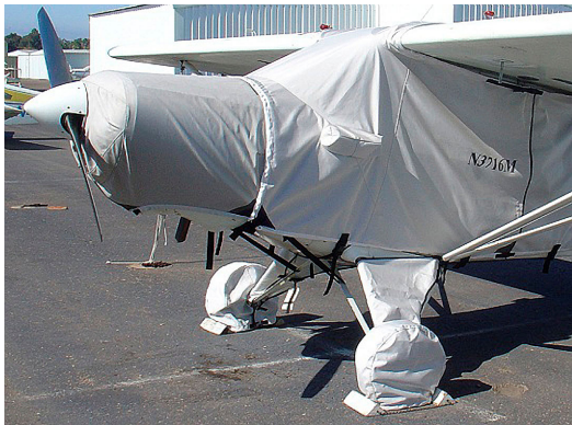
Piper PA-12 Landing Gear Covers

ALL-YEAR USE MATERIAL - Made with Silver Acrylic Sunbrella canvas, the all-year use material is the best option for sun protection and cover longevity. This heavier more durable material is intended for all weather conditions, such as rain and snow or lots of sun.