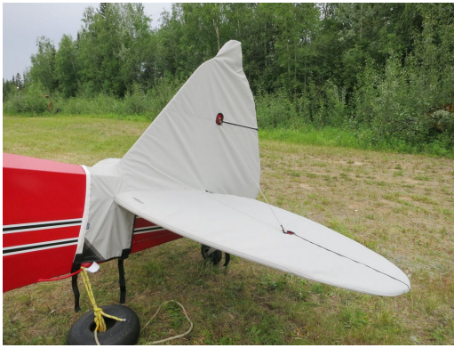
Piper PA-12 Abbreviated Empennage Cover