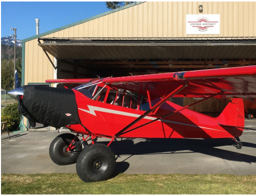
Piper PA-12 Insulated Engine Cover