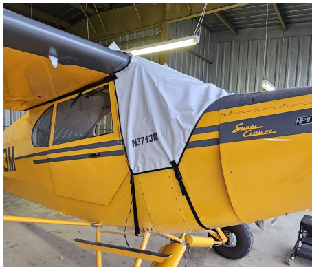
Piper PA-12: Super Cruiser, J5 Cub Windshield/Skylight Cover

the hottest of days. It is water, ice and snow repellent, yet breathable to allow moisture to escape from between the cover and the aircraft surface.