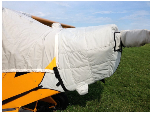
Piper J-3 Cub Insulated Engine Cover with added Pre-heater Access Flaps