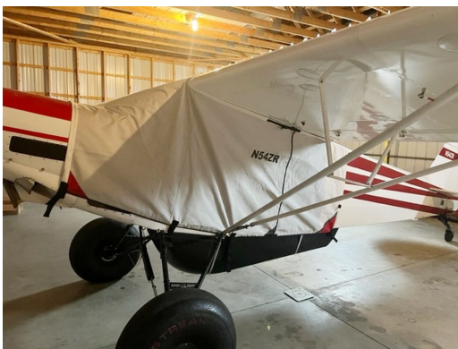
Piper PA-11 Extended Canopy Cover, Over the Top Style

This cover type is made from Silver Acrylic Sunbrella canvas and is 100% lined with a soft and smooth microfiber. Bruce's Custom Covers developed this material combination especially for aircraft protection. The outer material is medium weight and treated for water resistance, UV resistance and anti-static buildup. The inner lining is a very soft and smooth microfiber to prevent scratching. The material is very reflective, and tests show that the cabin interior temperature can be reduced to near-ambient temperature on the hottest of days. It is water, ice and snow repellent, yet breathable to allow moisture to escape from between the cover and the aircraft surface.