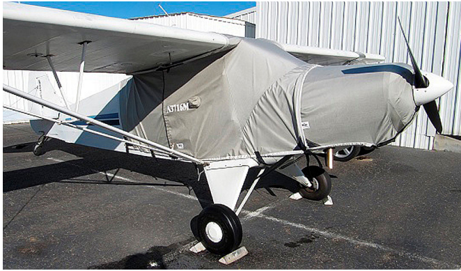
Piper PA-12 Super Cruiser Extended Over-the-Top Canopy Cover & Engine Cover

This cover type is made from Silver Acrylic Sunbrella canvas and is 100% lined with a soft and smooth microfiber. Bruce's Custom Covers developed this material combination especially for aircraft protection. The outer material is medium weight and treated for water resistance, UV resistance and anti-static buildup. The inner lining is a very soft and smooth microfiber to prevent scratching. The material is very reflective, and tests show that the cabin interior temperature can be reduced to near-ambient temperature on the hottest of days. It is water, ice and snow repellent, yet breathable to allow moisture to escape from between the cover and the aircraft surface.