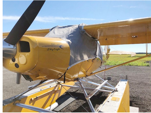
Piper PA-12 Super Cruiser Over-Top Canopy Cover Sportsman 2+2 Wag Aero Light Weight Over the Top Travel Canopy Cover