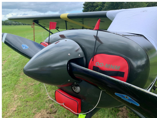
Piper PA-18 Super Cub Engine Plugs