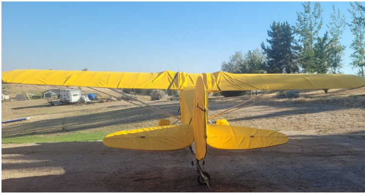
Piper PA-18 All Weather Cover Set