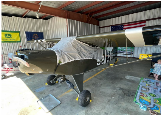
Piper PA-18 Super Cub L18-C Travel cover

This cover type is made from Silver Acrylic Sunbrella canvas and is 100% lined with a soft and smooth microfiber. Bruce's Custom Covers developed this material combination especially for aircraft protection. The outer material is medium weight and treated for water resistance, UV resistance and anti-static buildup. The inner lining is a very soft and smooth microfiber to prevent scratching. The material is very reflective, and tests show that the cabin interior temperature can be reduced to near-ambient temperature on the hottest of days. It is water, ice and snow repellent, yet breathable to allow moisture to escape from between the cover and the aircraft surface.