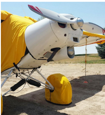
Piper PA-18 Super Cub Extended Canopy Cover, Wing & Tire Covers

ALL-YEAR USE MATERIAL - Made with Silver Acrylic Sunbrella canvas, the all-year use material is the best option for sun protection and cover longevity. This heavier more durable material is intended for all weather conditions, such as rain and snow or lots of sun.