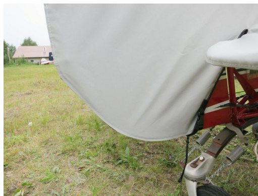
Piper PA-12 Abbreviated Empennage Cover