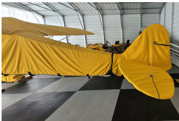
Piper PA-18 Empennage Cover

WINTER USE MATERIAL - Made with Solution-Dyed Polyester fabric, this option is intended for seasonal use to aid in deicing, rain mitigation, or for occasional travel. The material is lighter and more compact, but more susceptible to UV damage and may have a shorter useful life if used continuously outside than the all-year use material.