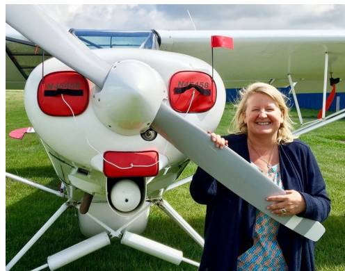
Piper PA-18 Super Cub Engine Inlet Plugs