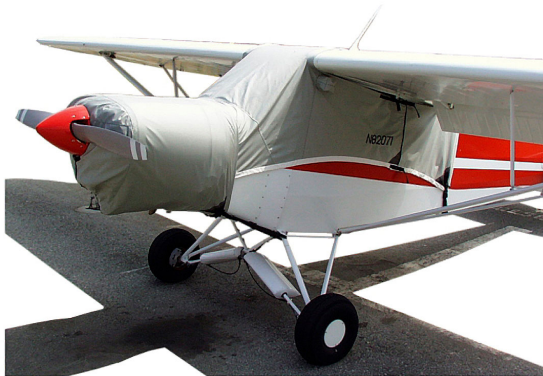
Piper PA-18 Super Cub Canopy & Engine Covers

This cover type is made from Silver Acrylic Sunbrella canvas and is 100% lined with a soft and smooth microfiber. Bruce's Custom Covers developed this material combination especially for aircraft protection. The outer material is medium weight and treated for water resistance, UV resistance and anti-static buildup. The inner lining is a very soft and smooth microfiber to prevent scratching. The material is very reflective, and tests show that the cabin interior temperature can be reduced to near-ambient temperature on the hottest of days. It is water, ice and snow repellent, yet breathable to allow moisture to escape from between the cover and the aircraft surface.