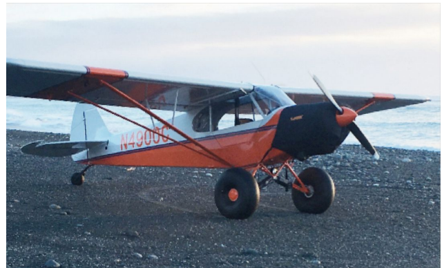
Piper Super Cub PA-18 Insulated Engine Cover