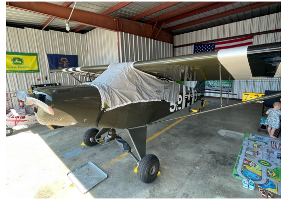
Piper PA-18 Super Cub L18-C Travel cover