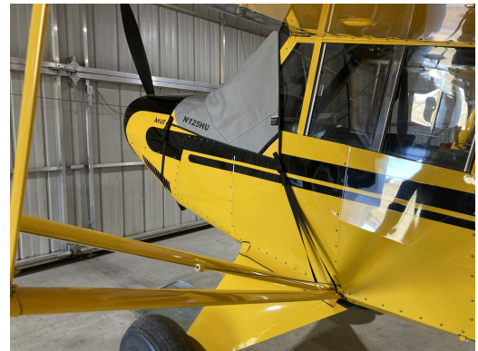
Aviat Husky Windshield/Skylight Cover