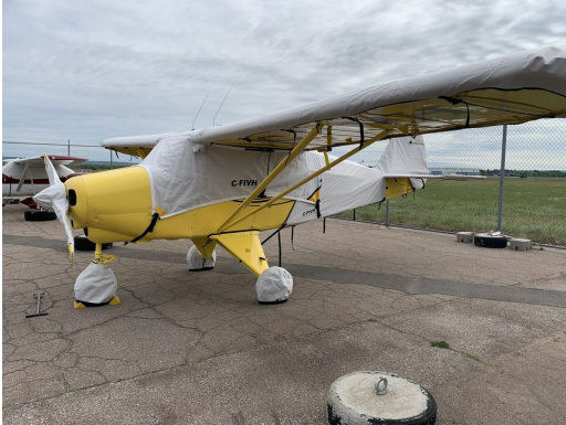
Piper PA-22 Tri-Pacer Cover Set

ALL-YEAR USE MATERIAL - Made with Silver Acrylic Sunbrella canvas, the all-year use material is the best option for sun protection and cover longevity. This heavier more durable material is intended for all weather conditions, such as rain and snow or lots of sun.