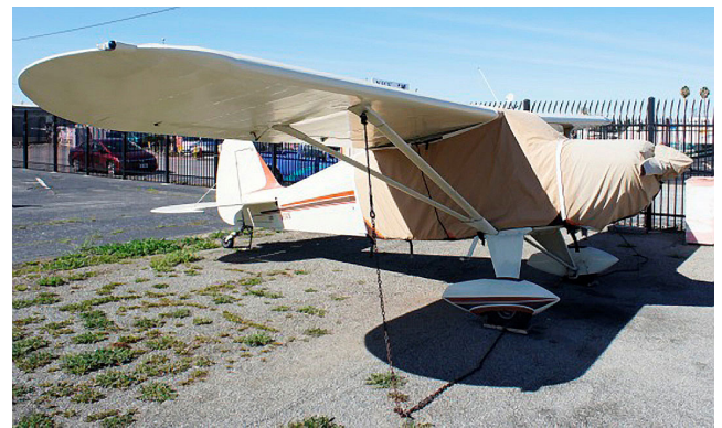
Piper PA-22-150 Pacer Extended Canopy, Engine & Prop/Spinner Covers