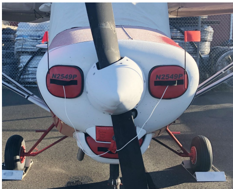
Piper PA-20 Engine Inlet Plugs

Engine Inlet Plugs are custom fit for your Piper Clipper, Pacer, Tri-Pacer, Vagabond, Colt: PA-15, 16, 20, 22 intakes, made with heavy-duty vinyl material, and stuffed with a single block of sculpted urethane foam. Each plug has a zipper that allows the foam to be removed and dried if necessary. Engine plugs have warning flags that are visible from the cockpit or 'remove before flight' streamers sewn onto the face of the plugs. Most plugs are imprinted with the aircraft registration number in black for an extra charge. Storage bag NOT included. Engine plugs may be inserted after flight when the engine is still warm. Engine Inlet Plugs are commonly referred to as Cowl Plugs, Intake Plugs, Cowl Blocks, Engine Blocks, and Engine Bungs.