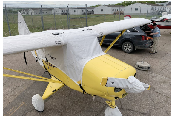
Piper PA-22 Tri-Pacer Cover Set