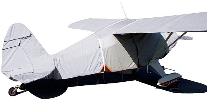
Piper Pacer Full Cover Set

Travel Covers are made with Silver Solution-Dyed Polyester fabric and only lined over the windshield to save weight. The material is lightweight and more compact for easy stowage in the aircraft. The polyester material is water resistant, but only intended for occasional use outside. We also have an ultra lightweight material available for fitted hangar dust covers. For daily outdoor use, the non-travel Sunbrella Cover is the best choice.