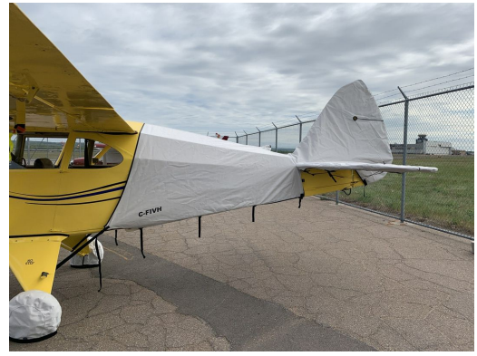
Piper PA-22 Tri-Pacer Empennage Cover