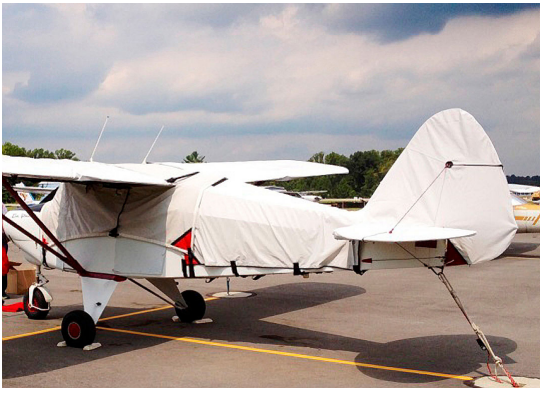
Piper Tri-Pacer Canopy, Empennage and Wing Covers