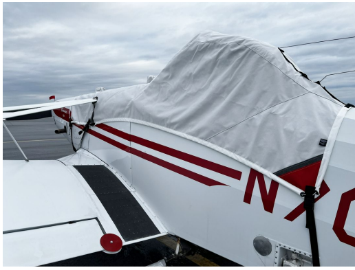
Piper Pawnee PA25 Canopy/Hopper Cover