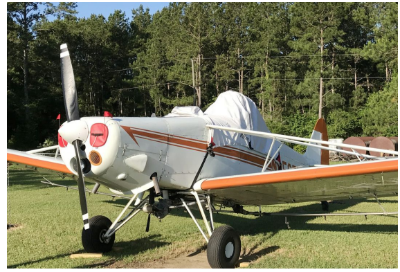
Piper Pawnee PA-25 Canopy/Hopper Cover, Engine Plugs