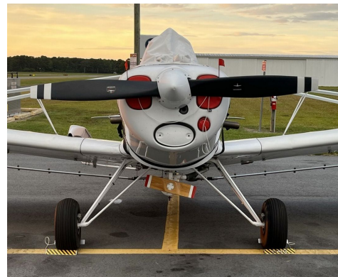
Piper PA-25 Pawnee Canopy/Hopper Cover