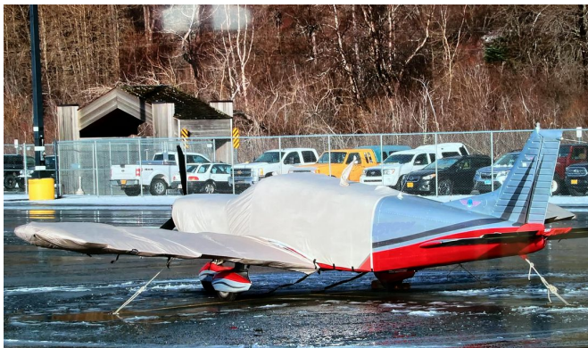
PA32-260 Extended Canopy/Engine & Wing Covers

WINTER USE MATERIAL - Made with Solution-Dyed Polyester fabric, this option is intended for seasonal use to aid in deicing, rain mitigation, or for occasional travel. The material is lighter and more compact, but more susceptible to UV damage and may have a shorter useful life if used continuously outside than the all-year use material.