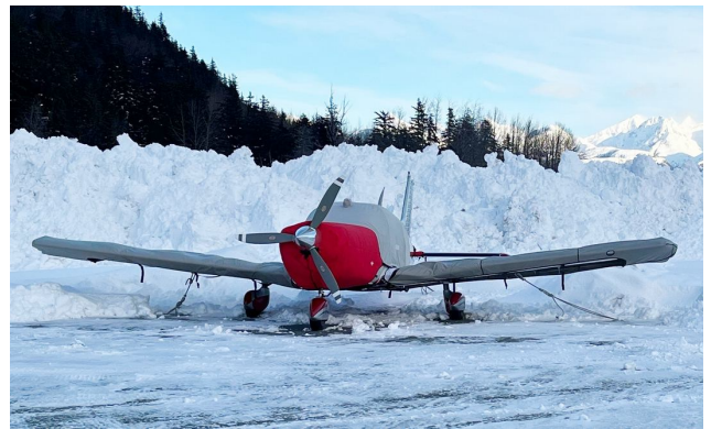
Piper PA-32-260 Winter Cover Set