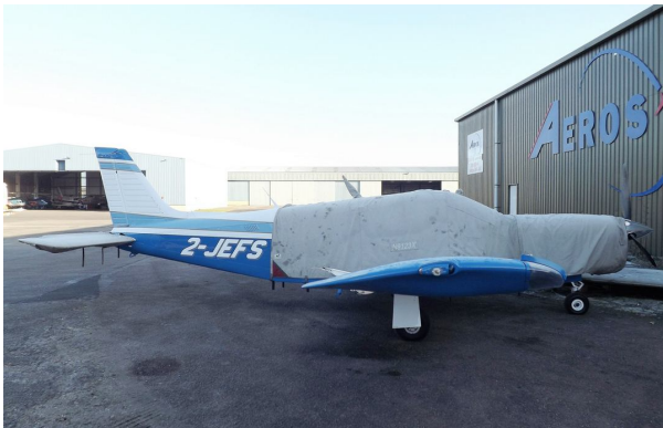
Piper PA-32R-301T Extended Canopy, Engine, Horiz. Stabilizer Covers

This cover type is made from Silver Acrylic Sunbrella canvas and is 100% lined with a soft and smooth microfiber. Bruce's Custom Covers developed this material combination especially for aircraft protection. The outer material is medium weight and treated for water resistance, UV resistance and anti-static buildup. The inner lining is a very soft and smooth microfiber to prevent scratching. The material is very reflective, and tests show that the cabin interior temperature can be reduced to near-ambient temperature on the hottest of days. It is water, ice and snow repellent, yet breathable to allow moisture to escape from between the cover and the aircraft surface.