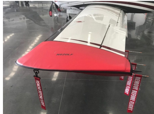
Piper Meridian Wingtip Pads, M600 Models