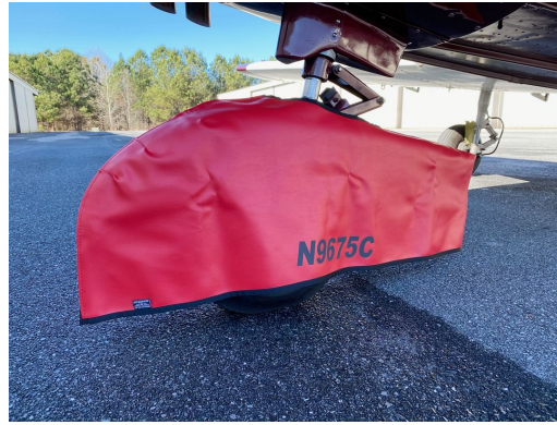
Piper PA-32 Saratoga Front Wheelpant Cover

protection and cover longevity. This heavier more durable material is intended for all weather conditions, such as rain and snow or lots of sun.