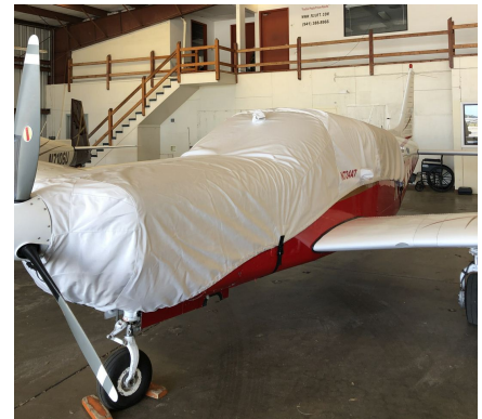
Piper PA-32R-301T Canopy/Engine Cover