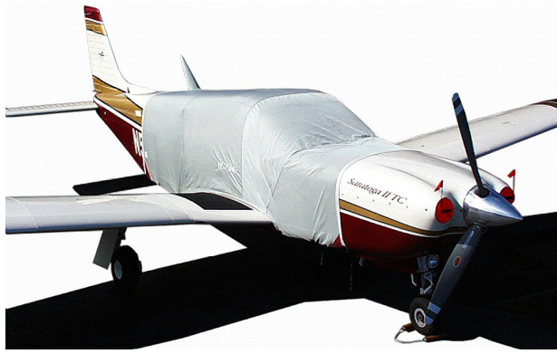
Piper Saratoga Extended Canopy Cover w/fwd Bib & Engine Plugs