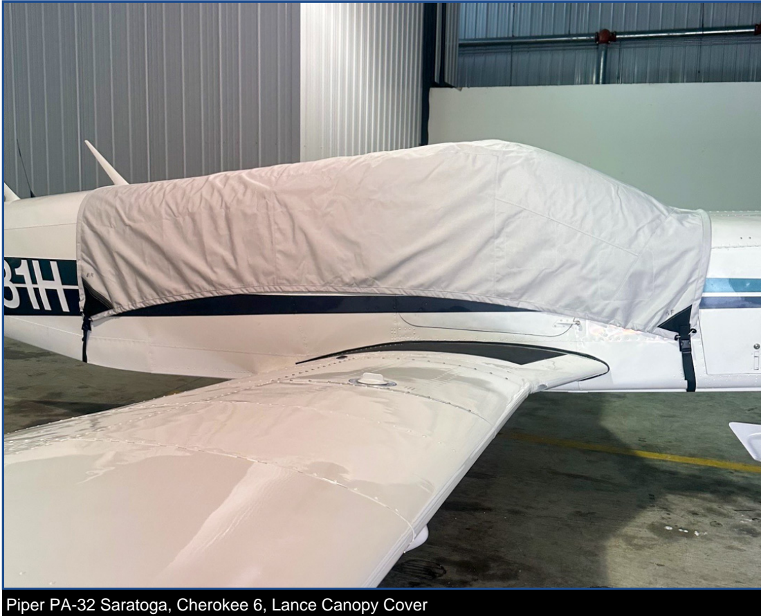
Piper PA-32 Saratoga, Cherokee 6, Lance Canopy Cover