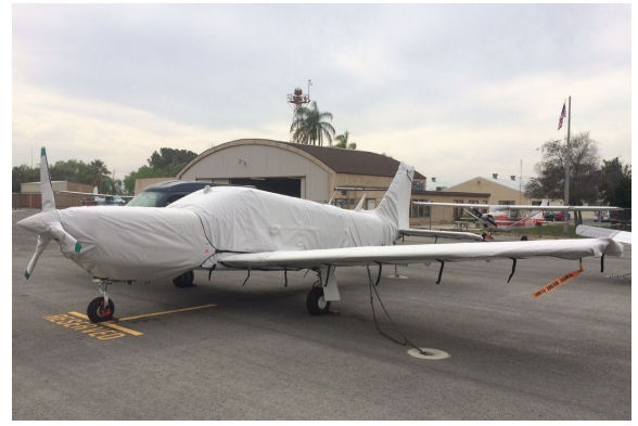
Piper Saratoga Cover Set