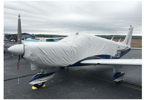
Piper PA-32 Cherokee Six Canopy/Nose Cover