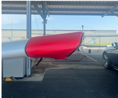
Piper PA-28-140 Wingtip Pads

Designed to prevent damage to the aircraft extremities in crowded hangars, these products are made of bright red Naugahyde and thickly padded with a sandwich of closed cell foam.