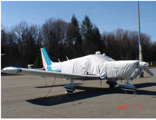
Piper PA32-300 Extended Canopy, Engine & Prop Covers