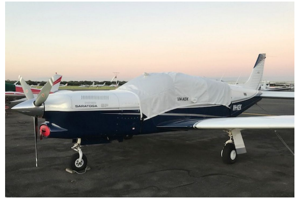
Piper Saratoga SP PA32R Canopy Cover