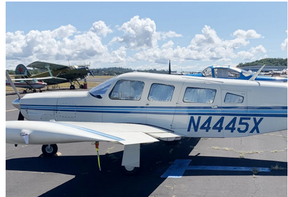
Piper PA32-300 HeatShield Set