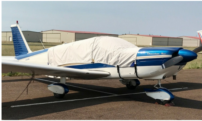
Piper Cherokee Six Canopy Cover with forward bib to cover baggage door.