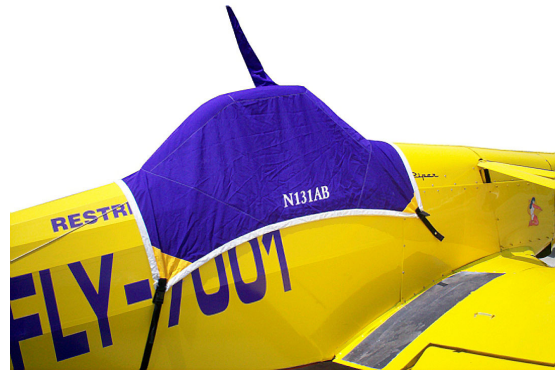
Piper Pawnee Canopy Cover