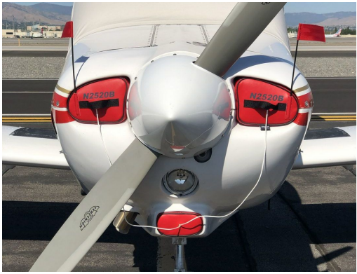
Piper Tomahawk Engine Inlet Plugs, set of 3