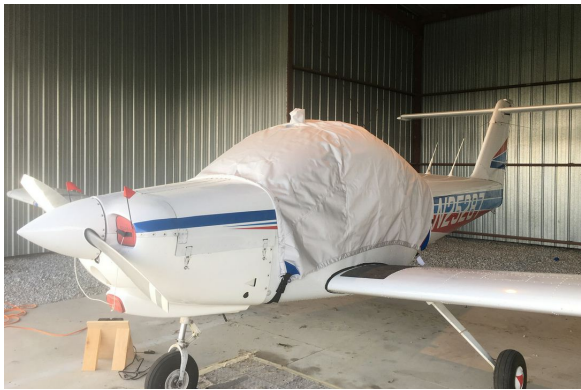
Piper PA-38 Canopy Cover

This cover type is made from Silver Acrylic Sunbrella canvas and is 100% lined with a soft and smooth microfiber. Bruce's Custom Covers developed this material combination especially for aircraft protection. The outer material is medium weight and treated for water resistance, UV resistance and anti-static buildup. The inner lining is a very soft and smooth microfiber to prevent scratching. The material is very reflective, and tests show that the cabin interior temperature can be reduced to near-ambient temperature on the hottest of days. It is water, ice and snow repellent, yet breathable to allow moisture to escape from between the cover and the aircraft surface.