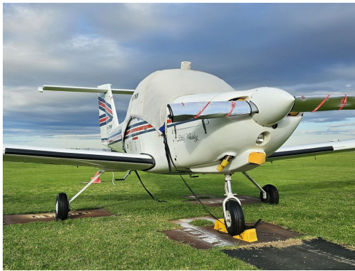
Piper PA-38 Tomahawk Canopy Cover