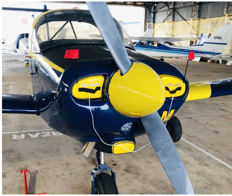
Piper PA-38 Tomahawk Engine Inlet Plugs with custom color