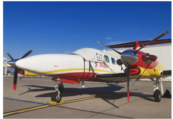
Piper PA-42 Cheyenne III Engine Plugs, Prop Ties, Cockpit Cover