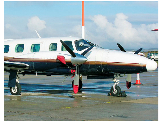
Piper PA-42 Cheyenne III Prop Tie/Exhaust Cover, Inlet Plugs