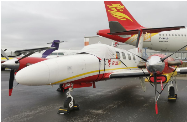
Piper PA-42 Cheyenne III Cockpit Cover, Prop Tie/Exhaust Cover, Inlet Plugs

This cover type is made from Silver Acrylic Sunbrella canvas and is 100% lined with a soft and smooth microfiber. Bruce's Custom Covers developed this material combination especially for aircraft protection. The outer material is medium weight and treated for water resistance, UV resistance and anti-static buildup. The inner lining is a very soft and smooth microfiber to prevent scratching. The material is very reflective, and tests show that the cabin interior temperature can be reduced to near-ambient temperature on the hottest of days. It is water, ice and snow repellent, yet breathable to allow moisture to escape from between the cover and the aircraft surface.