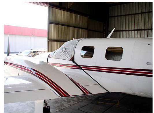
Piper Cheyenne Cockpit Cover