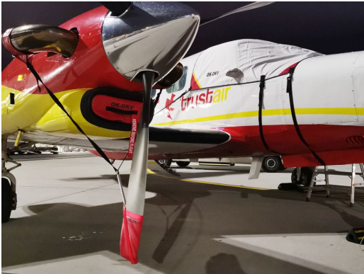
Piper PA-42 Cheyenne III Cockpit Cover, Prop Tie/Exhaust Cover, Inlet Plugs

Engine Inlet Plugs are custom fit for your Piper PA-42 Cheyenne III intakes, made with heavy-duty vinyl material, and stuffed with a single block of sculpted urethane foam. Each plug has a zipper that allows the foam to be removed and dried if necessary. Engine plugs have warning flags that are visible from the cockpit or 'remove before flight' streamers sewn onto the face of the plugs. Most plugs are imprinted with the aircraft registration number in black for an extra charge. Storage bag NOT included. Engine plugs may be inserted after flight when the engine is still warm. Engine Inlet Plugs are commonly referred to as Cowl Plugs, Intake Plugs, Cowl Blocks, Engine Blocks, and Engine Bungs.