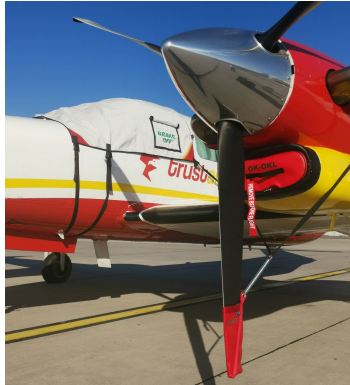
Piper PA-42 Cheyenne III Engine Plugs, Prop Ties, Cockpit Cover

Engine Inlet Plugs are custom fit for your Piper PA-42 Cheyenne III intakes, made with heavy-duty vinyl material, and stuffed with a single block of sculpted urethane foam. Each plug has a zipper that allows the foam to be removed and dried if necessary. Engine plugs have warning flags that are visible from the cockpit or 'remove before flight' streamers sewn onto the face of the plugs. Most plugs are imprinted with the aircraft registration number in black for an extra charge. Storage bag NOT included. Engine plugs may be inserted after flight when the engine is still warm. Engine Inlet Plugs are commonly referred to as Cowl Plugs, Intake Plugs, Cowl Blocks, Engine Blocks, and Engine Bungs.