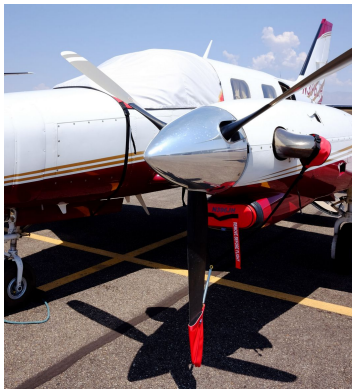
Piper Cheyenne Cockpit Cover, Engine Plugs, Prop Tie/Exhaust Covers

Travel Covers are made with Silver Solution-Dyed Polyester fabric and only lined over the windshield to save weight. The material is lightweight and more compact for easy stowage in the aircraft. The polyester material is water resistant, but only intended for occasional use outside. We also have an ultra lightweight material available for fitted hangar dust covers. For daily outdoor use, the non-travel Sunbrella Cover is the best choice.