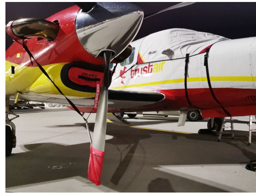
Piper PA-42 Cheyenne III Prop Tie/Exhaust Cover, Inlet Plugs