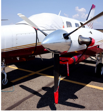
Piper Cheyenne Cockpit Cover, Engine Plugs, Prop Tie/Exhaust Covers

Engine Inlet Plugs are custom fit for your Piper PA-42 Cheyenne III intakes, made with heavy-duty vinyl material, and stuffed with a single block of sculpted urethane foam. Each plug has a zipper that allows the foam to be removed and dried if necessary. Engine plugs have warning flags that are visible from the cockpit or 'remove before flight' streamers sewn onto the face of the plugs. Most plugs are imprinted with the aircraft registration number in black for an extra charge. Storage bag NOT included. Engine plugs may be inserted after flight when the engine is still warm. Engine Inlet Plugs are commonly referred to as Cowl Plugs, Intake Plugs, Cowl Blocks, Engine Blocks, and Engine Bungs.