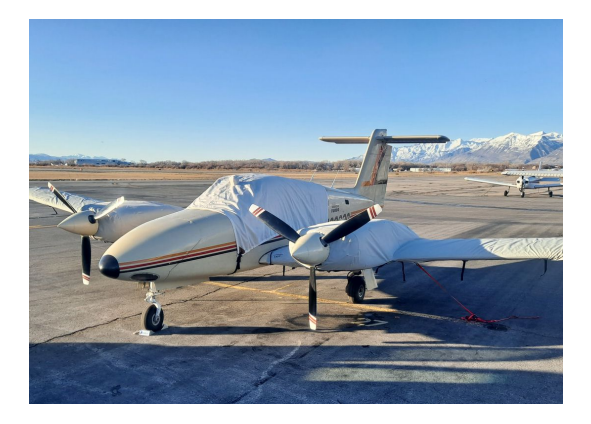
Piper PA-44 Wing/Engine Covers, Canopy Cover

WINTER USE MATERIAL - Made with Solution-Dyed Polyester fabric, this option is intended for seasonal use to aid in deicing, rain mitigation, or for occasional travel. The material is lighter and more compact, but more susceptible to UV damage and may have a shorter useful life if used continuously outside than the all-year use material.