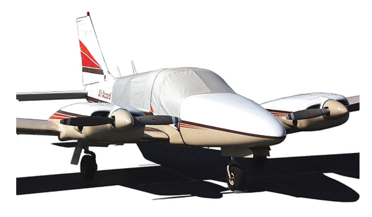
Piper Seneca PA-34 Canopy Cover

Travel Covers are made with Silver Solution-Dyed Polyester fabric and only lined over the windshield to save weight. The material is lightweight and more compact for easy stowage in the aircraft. The polyester material is water resistant, but only intended for occasional use outside. We also have an ultra lightweight material available for fitted hangar dust covers. For daily outdoor use, the non-travel Sunbrella Cover is the best choice.