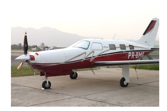
Piper Malibu/Mirage Engine Plugs, Cockpit HeatShields