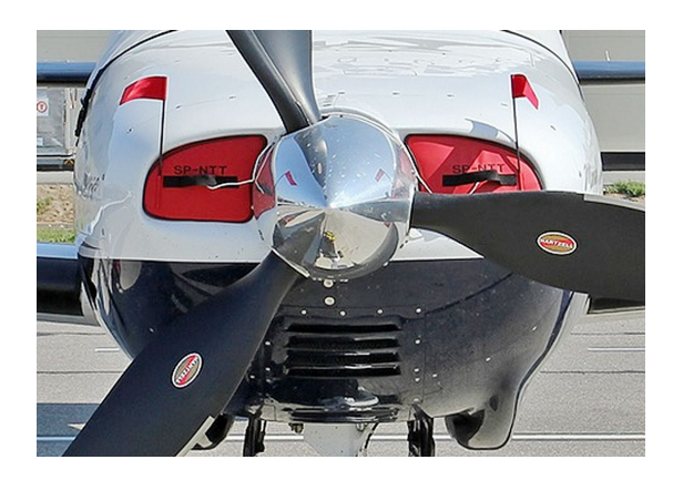
Piper PA-46-350P Mirage Engine Inlet Plugs

Engine Inlet Plugs are custom fit for your Piper PA-46 Malibu intakes, made with heavy-duty vinyl material, and stuffed with a single block of sculpted urethane foam. Each plug has a zipper that allows the foam to be removed and dried if necessary. Engine plugs have warning flags that are visible from the cockpit or 'remove before flight' streamers sewn onto the face of the plugs. Most plugs are imprinted with the aircraft registration number in black for an extra charge. Storage bag NOT included. Engine plugs may be inserted after flight when the engine is still warm. Engine Inlet Plugs are commonly referred to as Cowl Plugs, Intake Plugs, Cowl Blocks, Engine Blocks, and Engine Bungs.