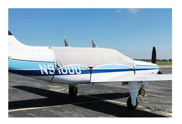
Piper PA-46 Malibu Travel Cover