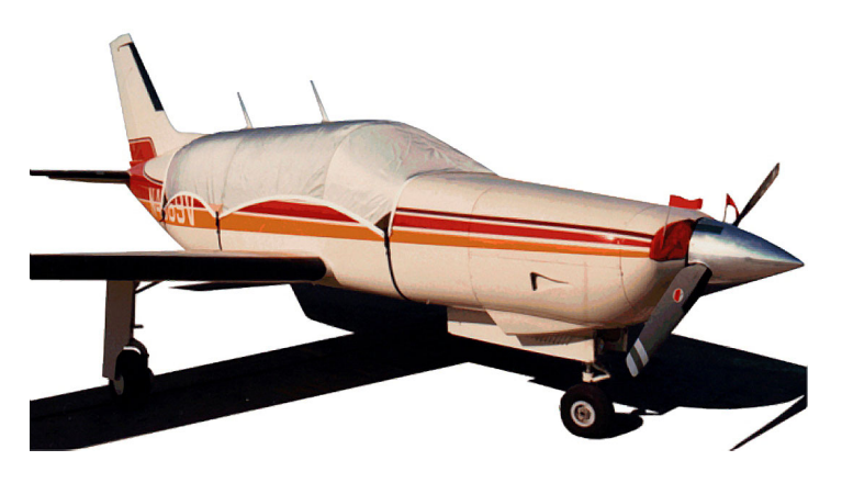
Piper Malibu/Mirage Standard Canopy Cover