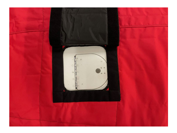
Malibu PA-46-310P Insulated Engine Cover, Oil Door Access

This cover type is made from Silver Acrylic Sunbrella canvas and is 100% lined with a soft and smooth microfiber. Bruce's Custom Covers developed this material combination especially for aircraft protection. The outer material is medium weight and treated for water resistance, UV resistance and anti-static buildup. The inner lining is a very soft and smooth microfiber to prevent scratching. The material is very reflective, and tests show that the cabin interior temperature can be reduced to near-ambient temperature on the hottest of days. It is water, ice and snow repellent, yet breathable to allow moisture to escape from between the cover and the aircraft surface.