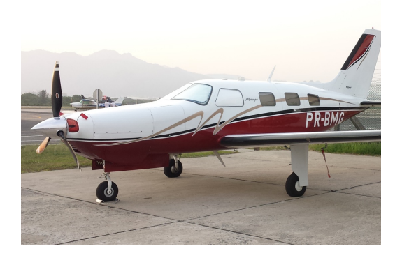
Piper Malibu/Mirage Engine Plugs, Cockpit HeatShields