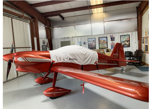
SPA Sport Panther Canopy Cover