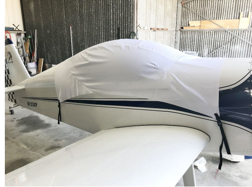
SPA, Sport Performance Aviation, Panther Canopy Cover (test fit cover)