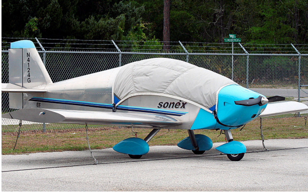
Sonex Canopy Cover

This cover type is made from Silver Acrylic Sunbrella canvas and is 100% lined with a soft and smooth microfiber. Bruce's Custom Covers developed this material combination especially for aircraft protection. The outer material is medium weight and treated for water resistance, UV resistance and anti-static buildup. The inner lining is a very soft and smooth microfiber to prevent scratching. The material is very reflective, and tests show that the cabin interior temperature can be reduced to near-ambient temperature on the hottest of days. It is water, ice and snow repellent, yet breathable to allow moisture to escape from between the cover and the aircraft surface.