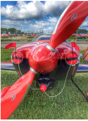
SPA Sport Panther Engine Plugs