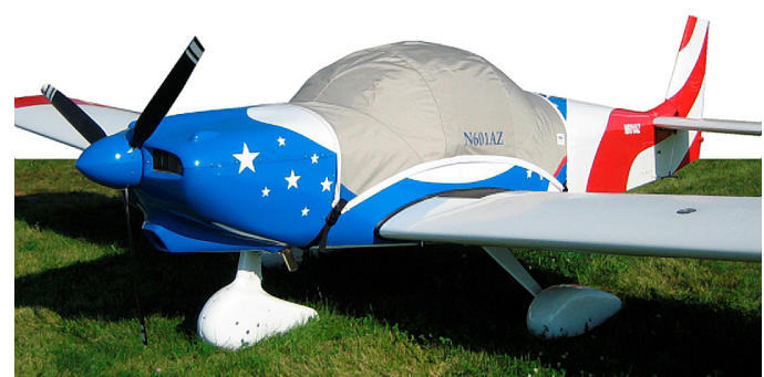
Zenith CH601 Canopy Cover