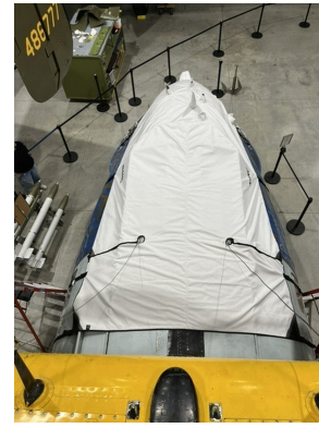
Consolidated Vultee PB5 Cockpit/Nose Cover