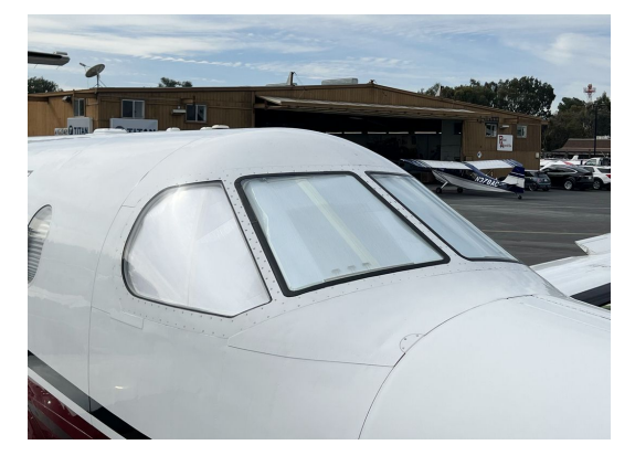
Pilatus PC-12 Cockpit HeatShields