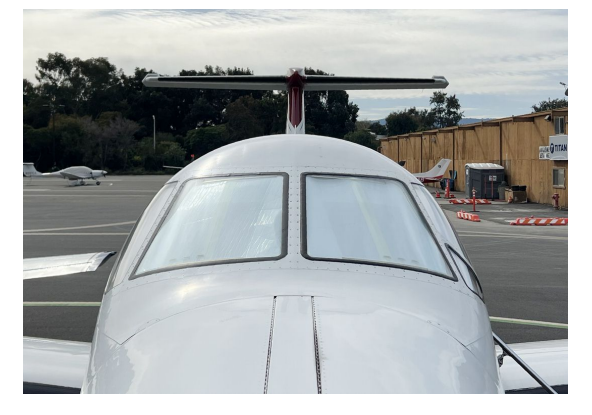
Pilatus PC-12 Cockpit HeatShields

Cockpit Heatshields are interior sunshades for the aircraft's cockpit. The product is a unique composite of closed-cell foam with a silver mylar finish. The semi-rigid design is stiff enough to stand inside the window framing. The set folds up flat and is easily stored in the included storage sleeve. Some designs may require velcro and suction cups. A Heatshield is an excellent short-term remedy for cockpit overheating, but an external fabric cover is more effective for long-term protection.