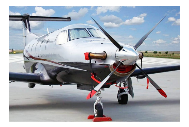
Pilatus PC-12 LARGE ENGINE INLET PLUG, SMALL PLUGS SET, Prop Tie/Exhaust Covers