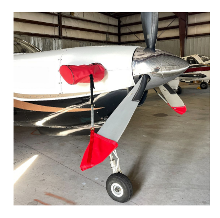
WH6 Harpoon Exhaust Covers/Prop Tie