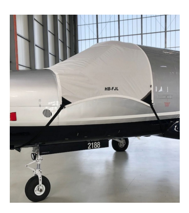
Pilatus PC-12 Cockpit Cover