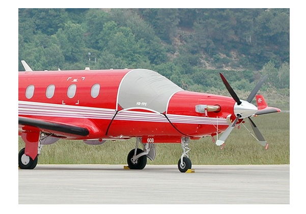
Pilatus PC-12 Windshield Cover

This cover type is made from Silver Acrylic Sunbrella canvas and is 100% lined with a soft and smooth microfiber. Bruce's Custom Covers developed this material combination especially for aircraft protection. The outer material is medium weight and treated for water resistance, UV resistance and anti-static buildup. The inner lining is a very soft and smooth microfiber to prevent scratching. The material is very reflective, and tests show that the cabin interior temperature can be reduced to near-ambient temperature on the hottest of days. It is water, ice and snow repellent, yet breathable to allow moisture to escape from between the cover and the aircraft surface.