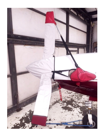
Pilatus PC-12 Prop Cover, Prop Tie/Exhaust Cover

This cover type is made from Silver Acrylic Sunbrella canvas and is 100% lined with a soft and smooth microfiber. Bruce's Custom Covers developed this material combination especially for aircraft protection. The outer material is medium weight and treated for water resistance, UV resistance and anti-static buildup. The inner lining is a very soft and smooth microfiber to prevent scratching. The material is very reflective, and tests show that the cabin interior temperature can be reduced to near-ambient temperature on the hottest of days. It is water, ice and snow repellent, yet breathable to allow moisture to escape from between the cover and the aircraft surface.