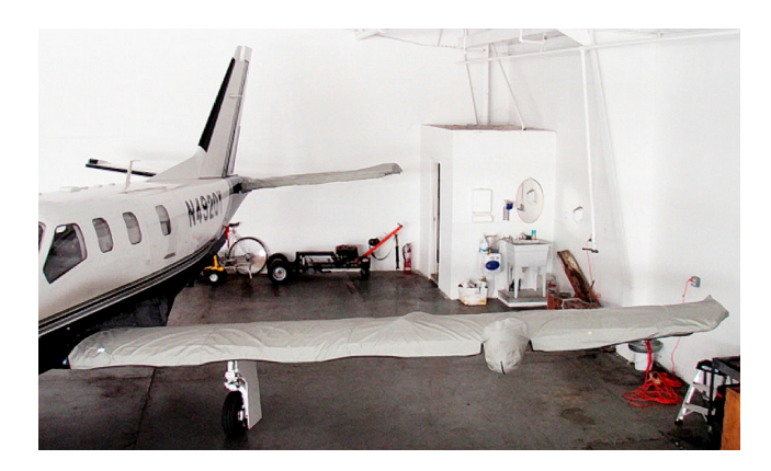
Piper PA-46 Malibu Complete Cover Set