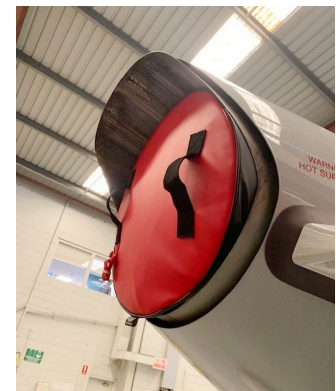
Pilatus PC-24 Engine Exhaust Plug