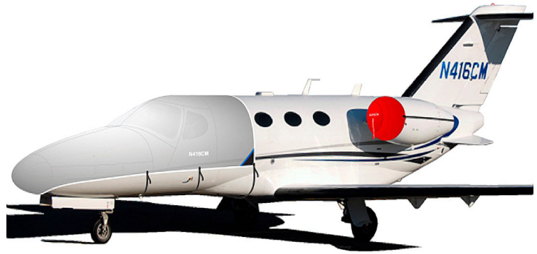
Citation Mustang Cockpit/Door/Nose Cover, Engine Inlet Cover