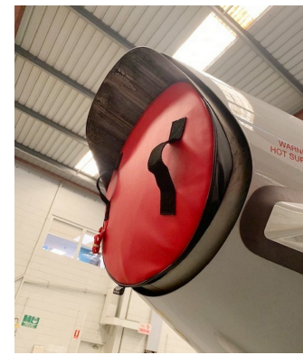
Pilatus PC-24 Engine Exhaust Plug