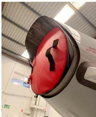
Pilatus PC-24 Engine Exhaust Plug

The Engine Inlet Plugs are custom fit for your Pilatus PC-24 intakes, made with heavy-duty vinyl material, and stuffed with a single block of sculpted urethane foam. Each plug has a zipper that allows the foam to be removed and dried if necessary. Engine plugs have 'remove before flight' streamers sewn onto the face of the plugs. Most plugs are imprinted with the aircraft registration number in black for an extra charge. Storage bag NOT included. Engine plugs may be inserted after flight when the engine is still warm. Engine Inlet Plugs are commonly referred to as Cowl Plugs, Intake Plugs, Cowl Blocks, Engine Blocks, and Engine Bungs.