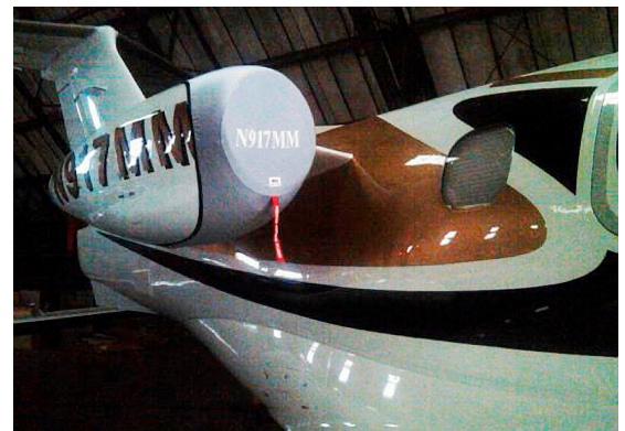
Phenom 100 Intake/Exhaust Cover, "Bikini" Type