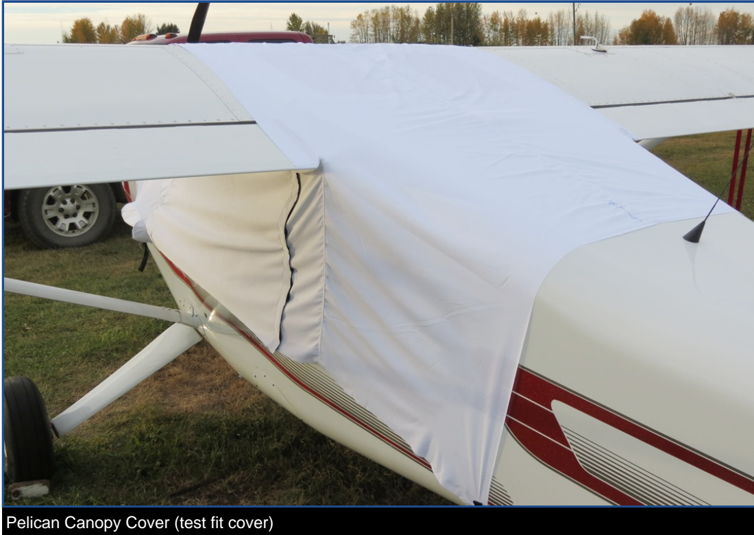
Pelican Canopy Cover (test fit cover)