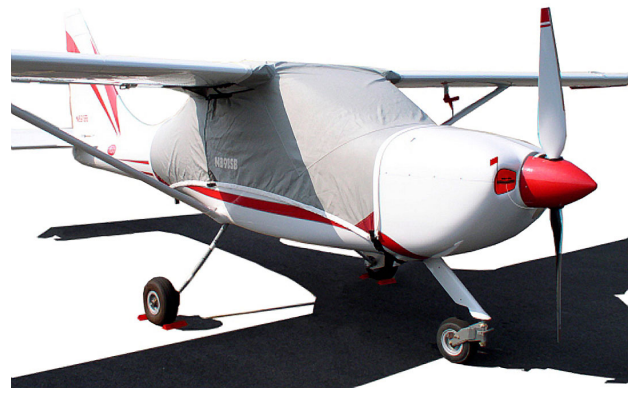
Glaster Over-Top Canopy Cover