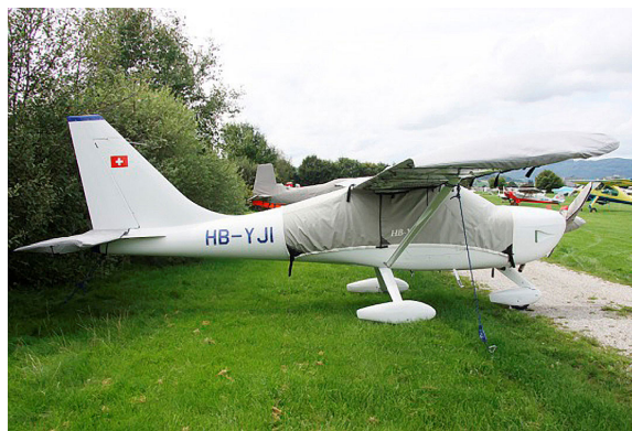
Glstar Canopy, Wings, Horizontal Stab. & Prop Covers

WINTER USE MATERIAL - Made with Solution-Dyed Polyester fabric, this option is intended for seasonal use to aid in deicing, rain mitigation, or for occasional travel. The material is lighter and more compact, but more susceptible to UV damage and may have a shorter useful life if used continuously outside than the all-year use material.