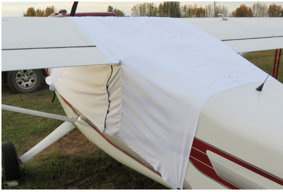
Pelican Canopy Cover (test fit cover)