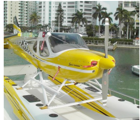
Glstar Engine Plugs