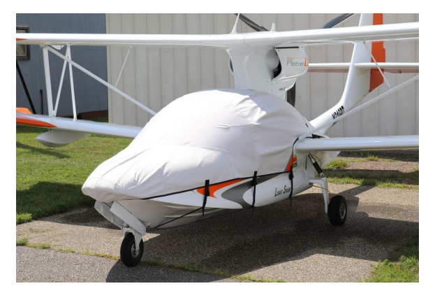
Scoda Aeronautica Super Petrel Canopy/Nose Cover

Travel Covers are made with Silver Solution-Dyed Polyester fabric and only lined over the windshield to save weight. The material is lightweight and more compact for easy stowage in the aircraft. The polyester material is water resistant, but only intended for occasional use outside. We also have an ultra lightweight material available for fitted hangar dust covers. For daily outdoor use, the non-travel Sunbrella Cover is the best choice.