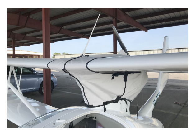
Scoda Aeronautica Super Petrel Engine Cover