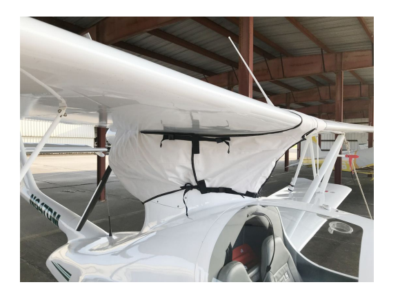
Scoda Aeronautica Super Petrel Engine Cover

Insulated Covers Material - A special composite material of solution-dyed polyester, 3M Thinsulate insulation, and soft nylon interior fabric. Our insulated covers are designed to complement an engine preheater and help retain heat in the engine compartment after shutdown. If you operate your aircraft in cold-weather, these covers will help prevent engine wear and tear.