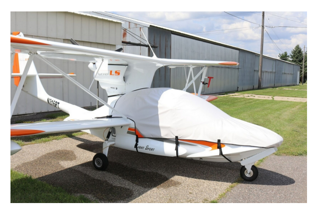
Scoda Aeronautica Super Petrel Canopy/Nose Cover