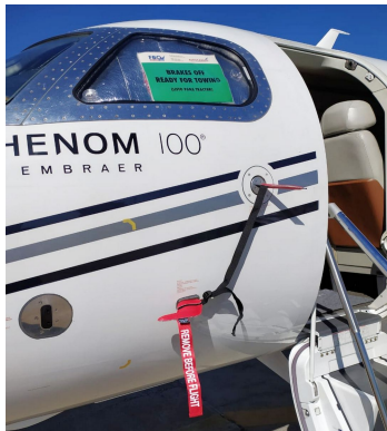
Phenom 100 (EMB 500) Pitot Cover/AOA Set

The Engine Inlet Plugs are custom fit for your Embraer Phenom 100 (EMB-500) intakes, made with heavy-duty vinyl material, and stuffed with a single block of sculpted urethane foam. Each plug has a zipper that allows the foam to be removed and dried if necessary. Engine plugs have 'remove before flight' streamers sewn onto the face of the plugs. Most plugs are imprinted with the aircraft registration number in black for an extra charge. Storage bag NOT included. Engine plugs may be inserted after flight when the engine is still warm. Engine Inlet Plugs are commonly referred to as Cowl Plugs, Intake Plugs, Cowl Blocks, Engine Blocks, and Engine Bungs.