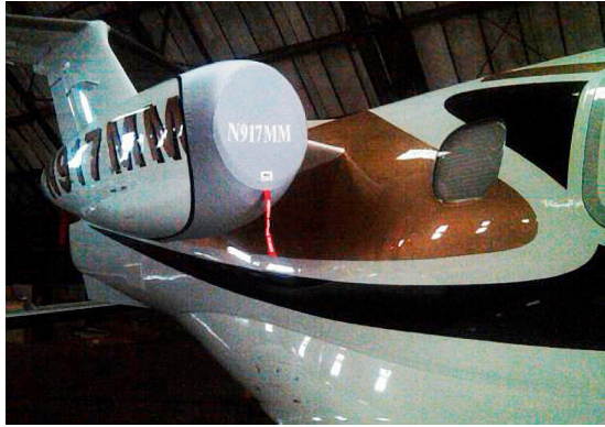
Phenom 100 Intake/Exhaust Cover, "Bikini" Type

Engine Inlet Plugs are commonly referred to as Cowl Plugs, Intake Plugs, Cowl Blocks, Engine Blocks, and Engine Bungs.