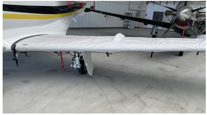
Embraer Phenom 100 Canopy/Nose Cover