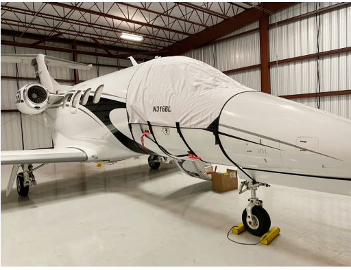
Embraer Phenom 100 Cockpit Cover