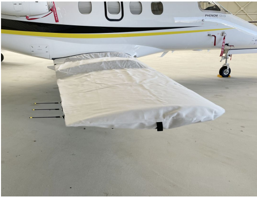
Embraer Phenom 100 Canopy/Nose Cover