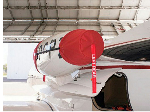
Phenom 100 Tri-fold style Engine Cover Set