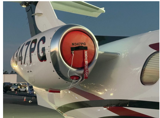
Embraer Phenom 100 Intake & Exhaust Plugs