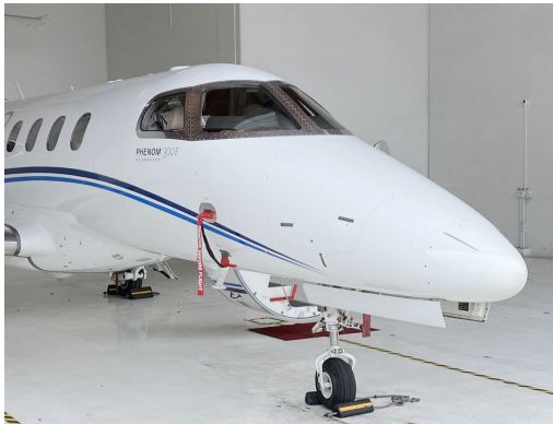
Embraer EMB-505 Pitot Cover Set