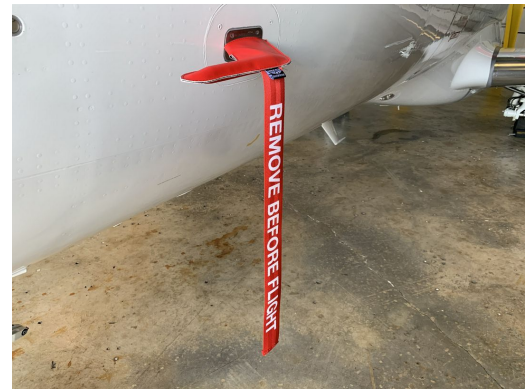
Embraer Phenom 300 Pitot Covers