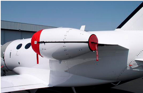
Cessna Mustang Intake/Exhaust Plug Set

The Engine Inlet Plugs are custom fit for your Embraer Phenom 300 (EMB-505) intakes, made with heavy-duty vinyl material, and stuffed with a single block of sculpted urethane foam. Each plug has a zipper that allows the foam to be removed and dried if necessary. Engine plugs have 'remove before flight' streamers sewn onto the face of the plugs. Most plugs are imprinted with the aircraft registration number in black for an extra charge. Storage bag NOT included. Engine plugs may be inserted after flight when the engine is still warm. Engine Inlet Plugs are commonly referred to as Cowl Plugs, Intake Plugs, Cowl Blocks, Engine Blocks, and Engine Bungs.