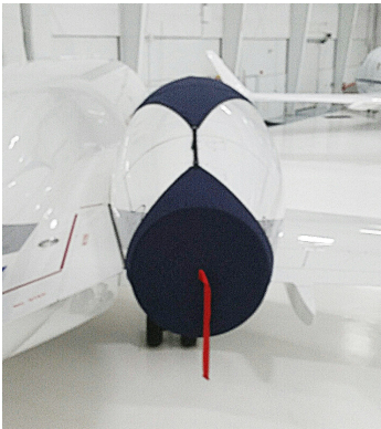
Challenger 300 Intake/Exhaust Cover Set, 3-strap type