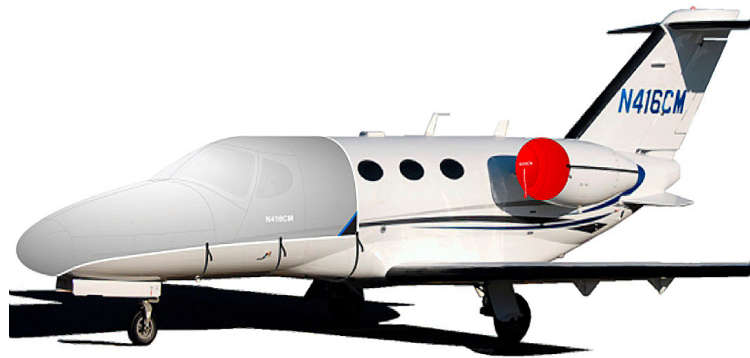
Citation Mustang Cockpit/Door/Nose Cover, Engine Inlet Cover