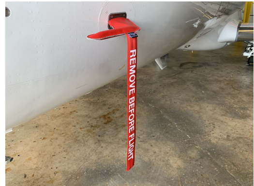
Embraer Phenom 300 Pitot Covers