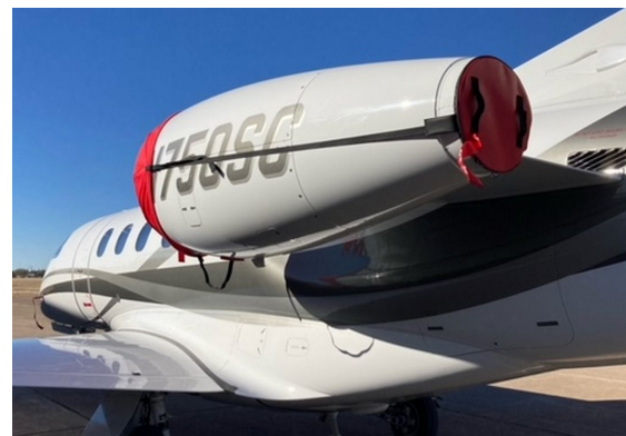
Challenger 300 Intake/Exhaust Cover Set, 3-strap type Embraer Phenom 300 (EMB-505) Engine Inlet Covers & Exhaust Plugs