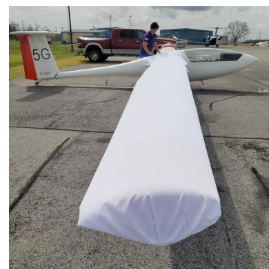
PIK 20B Wing Covers, test fit cover