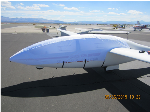
DG-505 Canopy/Nose Cover (test fit cover)