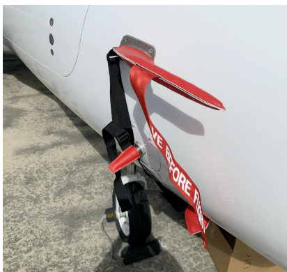
Beech Premier Pitot, AOA, Rosemont Cover Set

The Hawker Beechcraft Premier 390 Intake/Exhaust Plugs are custom fit for the intake and exhaust openings, made with heavy-duty vinyl material, and stuffed with a single block of sculpted urethane foam. Each plug has a zipper that allows the foam to be removed and dried if necessary. Engine plugs have 'remove before flight' streamers sewn onto the face of the plugs. Most plugs are imprinted with the aircraft registration number in black. Engine plugs may be inserted after flight when the engine is still warm. Engine Inlet Plugs are commonly referred to as Cowl Plugs, Intake Plugs, Cowl Blocks, Engine Blocks, and Engine Bungs.