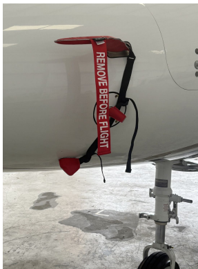
Hawker Beechcraft Premier Pitot, AOA, Icing Cover Set

The Hawker Beechcraft Premier 390 Intake/Exhaust Plugs are custom fit for the intake and exhaust openings, made with heavy-duty vinyl material, and stuffed with a single block of sculpted urethane foam. Each plug has a zipper that allows the foam to be removed and dried if necessary. Engine plugs have 'remove before flight' streamers sewn onto the face of the plugs. Most plugs are imprinted with the aircraft registration number in black. Engine plugs may be inserted after flight when the engine is still warm. Engine Inlet Plugs are commonly referred to as Cowl Plugs, Intake Plugs, Cowl Blocks, Engine Blocks, and Engine Bungs.