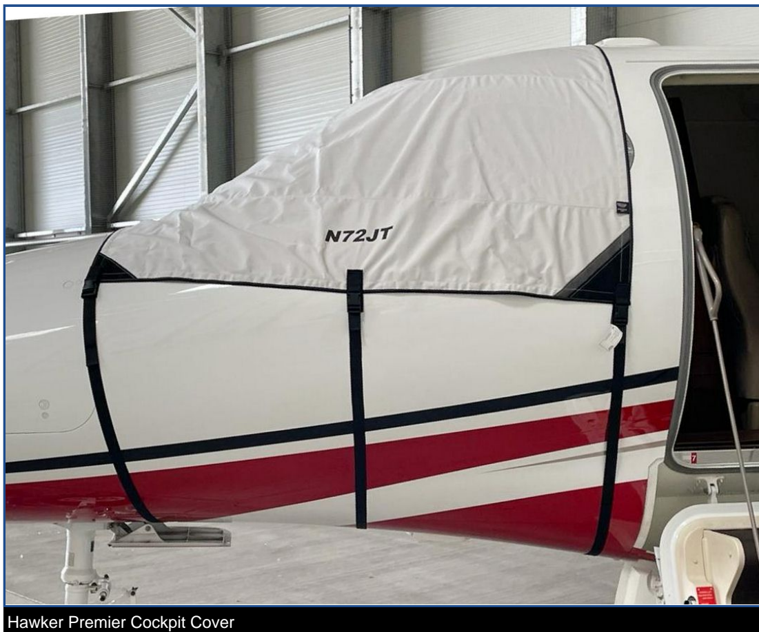
Hawker Premier Cockpit Cover