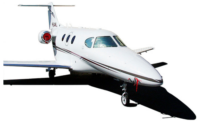
Raytheon Premier Intake Plugs, Pitot Covers & Cockpit HeatShields