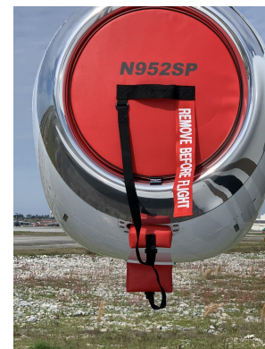
Beech Premier 1A Intake/Exhaust Plug Set