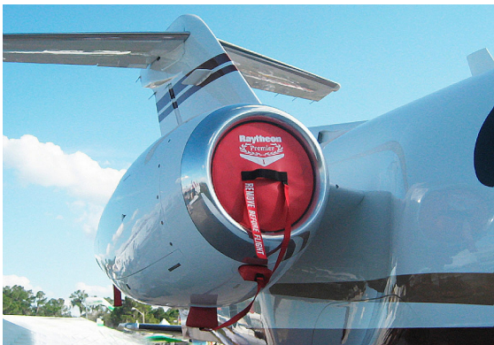
Premier Intake/Exhaust Plug set with Generator Inlet/Exhaust Plugs