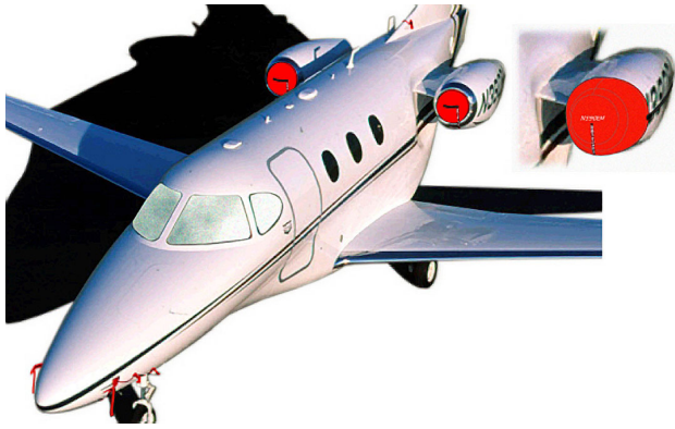
Premier Intake Plugs, Intake Covers, Pitot Covers & Cockpit HeatShields

Heatshield is an excellent short-term remedy for cockpit overheating, but an external fabric cover is more effective for long-term protection.