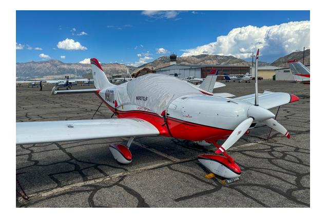
Piper PiperSport Canopy Cover