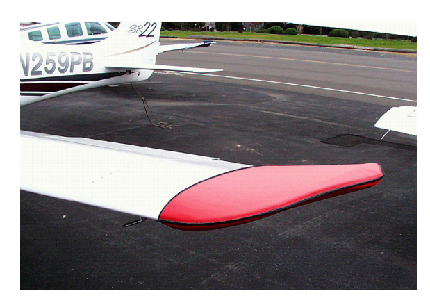
Cirrus SR-22 Wingtip Pad (also available for the Horiz. Stab.

Designed to prevent damage to the aircraft extremities in crowded hangars, these products are made of bright red Naugahyde and thickly padded with a sandwich of closed cell foam.