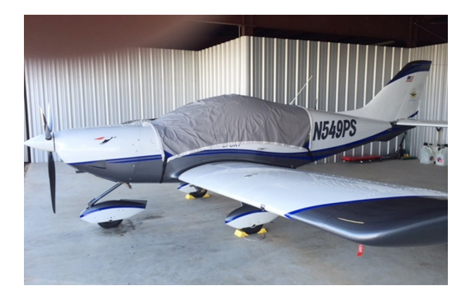
PiperSport Light Weight Travel Cover