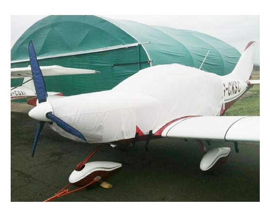
PiperSport Canopy/Engine Cover, Wing Locker Covers