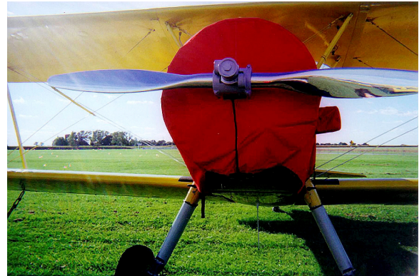
Stearman Engine Cover