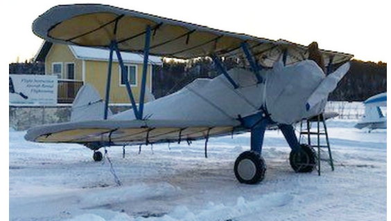
Boeing Stearman PT-13 Winter Cover Set