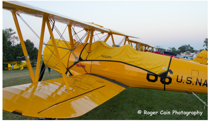
Boeing Stearman PT-13 Canopy & Engine Covers (std. color is silver)