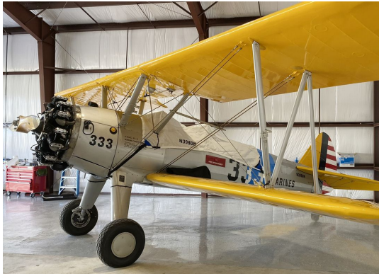
Stearman PT-13B Canopy Cover

the hottest of days. It is water, ice and snow repellent, yet breathable to allow moisture to escape from between the cover and the aircraft surface.