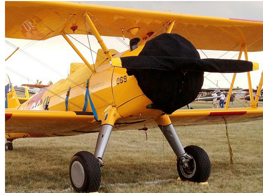
Stearman Canopy & Engine Covers (std. color is silver)