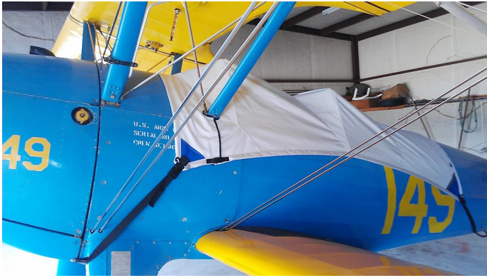
Boeing Stearman PT-13 Canopy Cover

the hottest of days. It is water, ice and snow repellent, yet breathable to allow moisture to escape from between the cover and the aircraft surface.