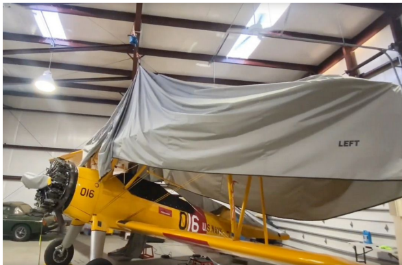
#6: Three ropes on one hoist.

Some high value aircraft end up logging lots of hangar time, and become dust magnets in the process. A high quality, well fitting dust cover provides easy assurance that the aircraft's surfaces remain clean and free of grit and grime. Available in a large variety of colors, each dust cover is custom made according to aircraft details and customer preferences. Fire retardant fabrics are also available.