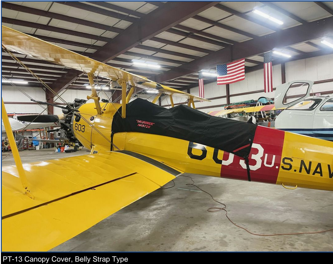
PT-13 Canopy Cover, Belly Strap Type