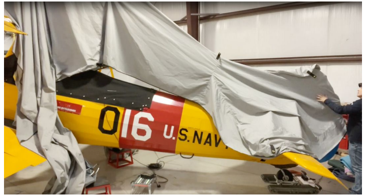
#4: Pull out to the edges.