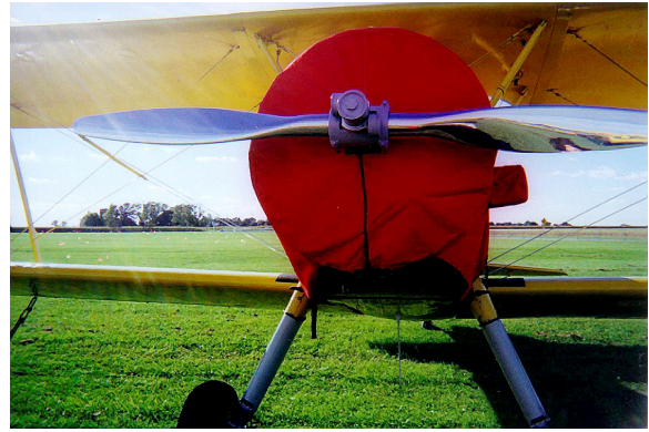
Stearman Engine Cover