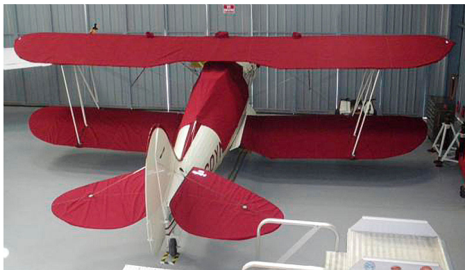
Waco UPF-7 Upper/Lower Wing Cover, Horizontal Stabilizer Cover, & Canopy Cover

WINTER USE MATERIAL - Made with Solution-Dyed Polyester fabric, this option is intended for seasonal use to aid in deicing, rain mitigation, or for occasional travel. The material is lighter and more compact, but more susceptible to UV damage and may have a shorter useful life if used continuously outside than the all-year use material.