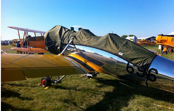
Ryan PT-22 Canopy Cover and Engine Cover

This cover type is made from Silver Acrylic Sunbrella canvas and is 100% lined with a soft and smooth microfiber. Bruce's Custom Covers developed this material combination especially for aircraft protection. The outer material is medium weight and treated for water resistance, UV resistance and anti-static buildup. The inner lining is a very soft and smooth microfiber to prevent scratching. The material is very reflective, and tests show that the cabin interior temperature can be reduced to near-ambient temperature on the hottest of days. It is water, ice and snow repellent, yet breathable to allow moisture to escape from between the cover and the aircraft surface.