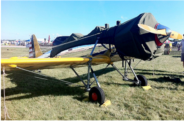
Ryan PT-22 Canopy Cover and Engine Cover

This cover type is made from Silver Acrylic Sunbrella canvas and is 100% lined with a soft and smooth microfiber. Bruce's Custom Covers developed this material combination especially for aircraft protection. The outer material is medium weight and treated for water resistance, UV resistance and anti-static buildup. The inner lining is a very soft and smooth microfiber to prevent scratching. The material is very reflective, and tests show that the cabin interior temperature can be reduced to near-ambient temperature on the hottest of days. It is water, ice and snow repellent, yet breathable to allow moisture to escape from between the cover and the aircraft surface.