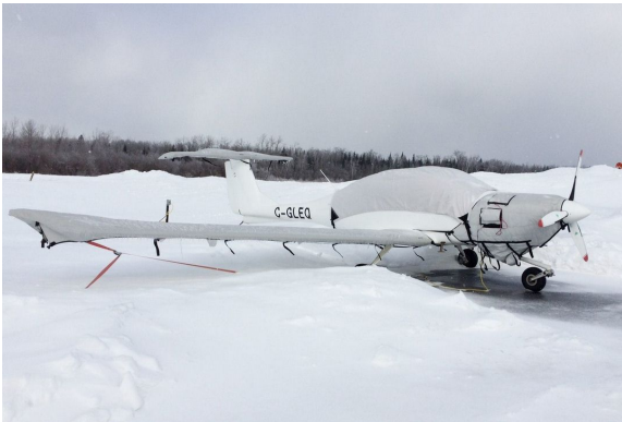
Diamond DA40 Canopy, Insulated Engine, Wing and Stab. Covers

Travel Covers are made with Silver Solution-Dyed Polyester fabric and only lined over the windshield to save weight. The material is lightweight and more compact for easy stowage in the aircraft. The polyester material is water resistant, but only intended for occasional use outside. We also have an ultra lightweight material available for fitted hangar dust covers. For daily outdoor use, the non-travel Sunbrella Cover is the best choice.