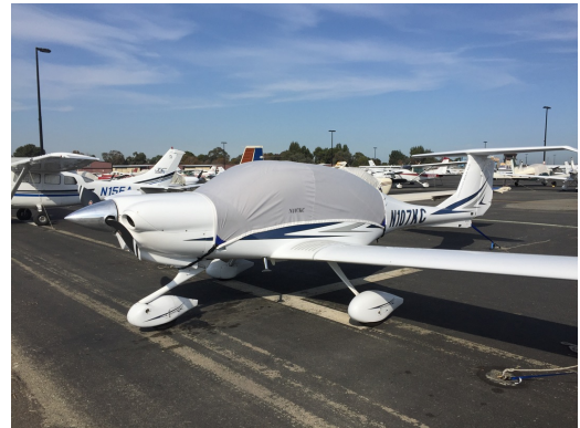
Diamond DA-40 Travel Cover, Light Weight Travel Canopy Cover