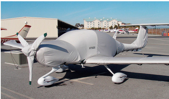
Diamond DA-40 Full Cover Set

This cover type is made from Silver Acrylic Sunbrella canvas and is 100% lined with a soft and smooth microfiber. Bruce's Custom Covers developed this material combination especially for aircraft protection. The outer material is medium weight and treated for water resistance, UV resistance and anti-static buildup. The inner lining is a very soft and smooth microfiber to prevent scratching. The material is very reflective, and tests show that the cabin interior temperature can be reduced to near-ambient temperature on the hottest of days. It is water, ice and snow repellent, yet breathable to allow moisture to escape from between the cover and the aircraft surface.