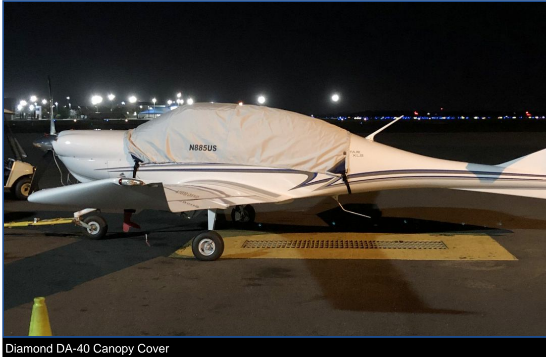
Diamond DA-40 Canopy Cover