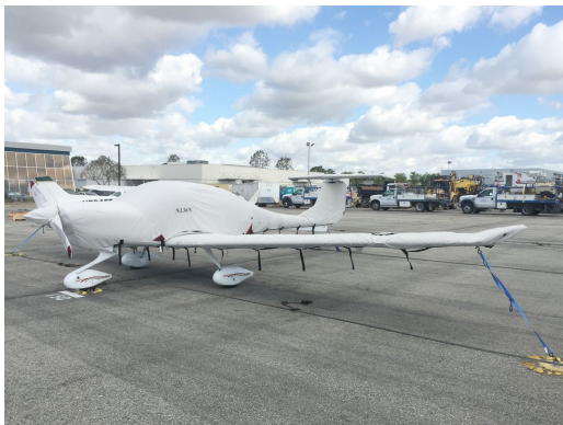
Diamond DA-40 Full Cover Set

This cover type is made from Silver Acrylic Sunbrella canvas and is 100% lined with a soft and smooth microfiber. Bruce's Custom Covers developed this material combination especially for aircraft protection. The outer material is medium weight and treated for water resistance, UV resistance and anti-static buildup. The inner lining is a very soft and smooth microfiber to prevent scratching. The material is very reflective, and tests show that the cabin interior temperature can be reduced to near-ambient temperature on the hottest of days. It is water, ice and snow repellent, yet breathable to allow moisture to escape from between the cover and the aircraft surface.