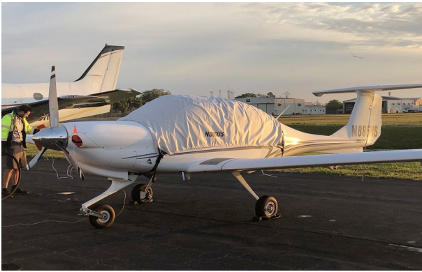
Diamond DA-40 Canopy Cover & Engine Plugs

Engine Inlet Plugs are custom fit for your Pipistrel Panthera intakes, made with heavy-duty vinyl material, and stuffed with a single block of sculpted urethane foam. Each plug has a zipper that allows the foam to be removed and dried if necessary. Engine plugs have warning flags that are visible from the cockpit or 'remove before flight' streamers sewn onto the face of the plugs. Most plugs are imprinted with the aircraft registration number in black for an extra charge. Storage bag NOT included. Engine plugs may be inserted after flight when the engine is still warm. Engine Inlet Plugs are commonly referred to as Cowl Plugs, Intake Plugs, Cowl Blocks, Engine Blocks, and Engine Bungs.