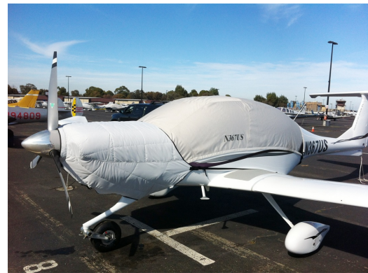
Diamond DA-40 Insulated Engine Cover, Silver/Grey