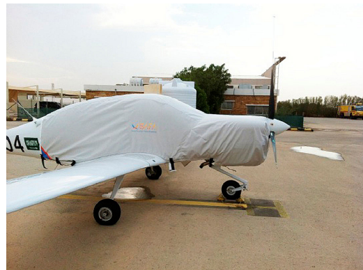
Diamond DA-40NG Extended Canopy/Engine Cover