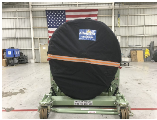
CFM56-5B Off Link Cover, fully enclosed