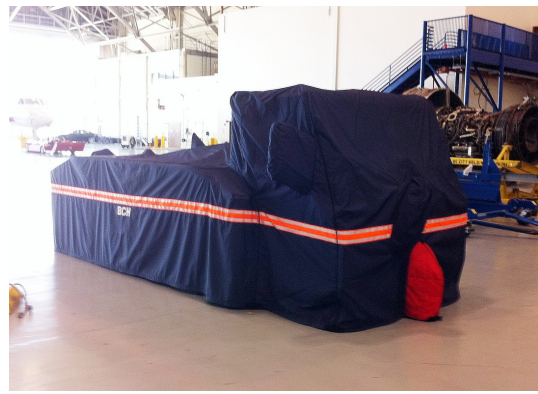
Complete Cover for Eagle Tug