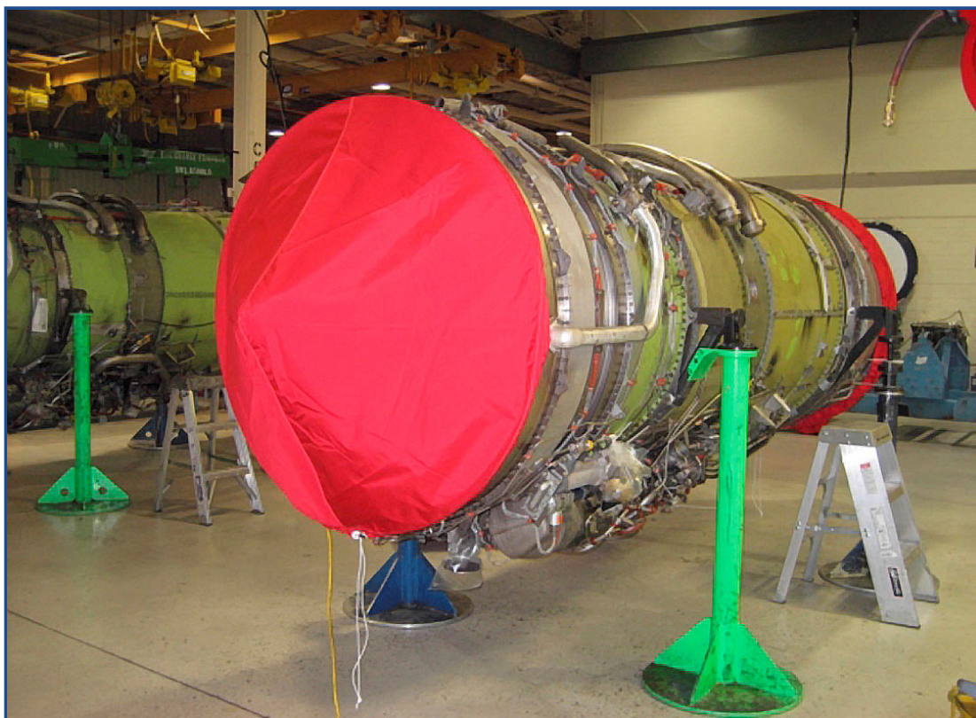
PW JT8D Off-Link Engine Shower Cap Cover Set