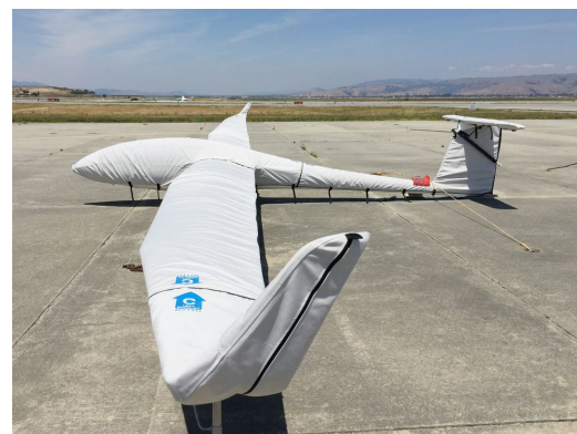
Schempp-Hirth Discus 2B Full Cover Set