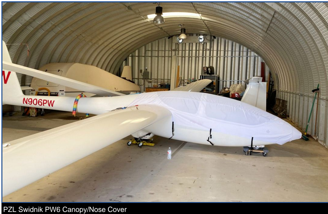
PZL Swidnik PW6 Canopy/Nose Cover