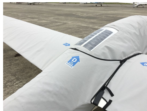
DG-505 Full Cover Set