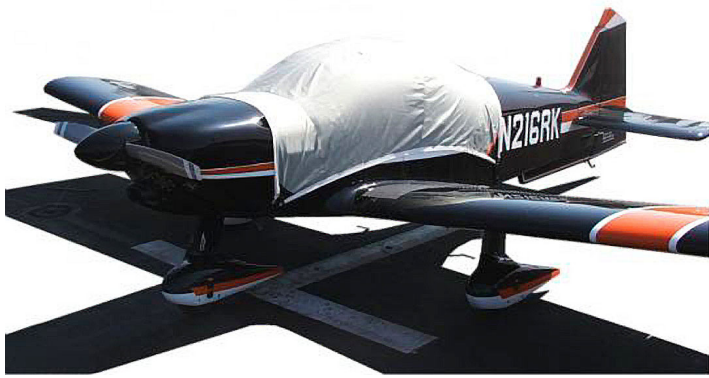
Robin R.2160 Canopy Cover

the hottest of days. It is water, ice and snow repellent, yet breathable to allow moisture to escape from between the cover and the aircraft surface.