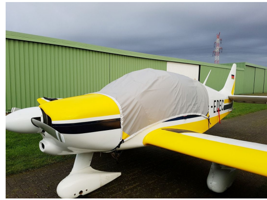
Robin DR400/R Travel Cover, Light Weight Travel Canopy Cover