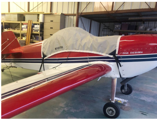
IAC One Design Travel Weight Canopy Cover

Travel Covers are made with Silver Solution-Dyed Polyester fabric and only lined over the windshield to save weight. The material is lightweight and more compact for easy stowage in the aircraft. The polyester material is water resistant, but only intended for occasional use outside. We also have an ultra lightweight material available for fitted hangar dust covers. For daily outdoor use, the non-travel Sunbrella Cover is the best choice.