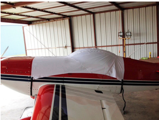
IAC One Design Canopy Cover, test fit cover