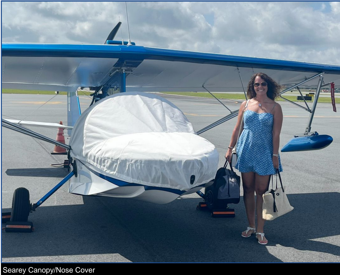
Searey Canopy/Nose Cover