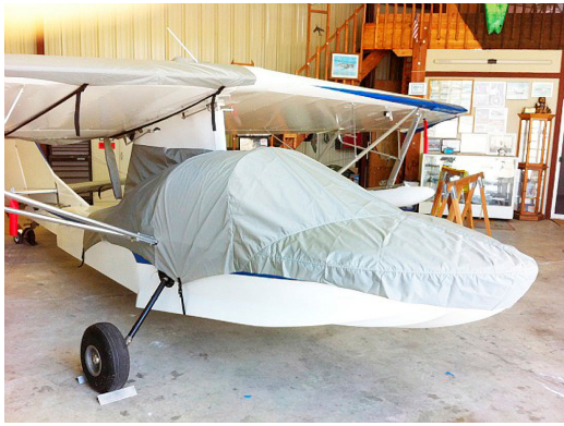
SeaRey Canopy Cover (test fit cover)