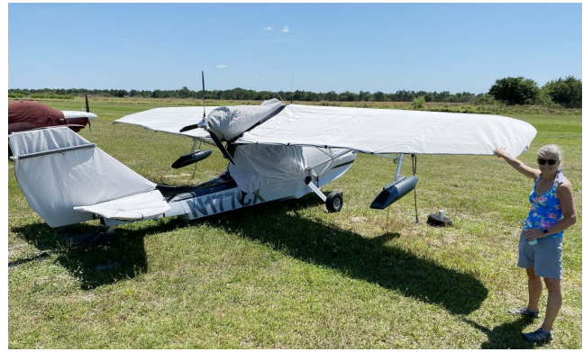
Searey Complete Cover Set