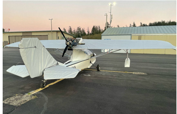
SeaRey Empennage & Wing Covers