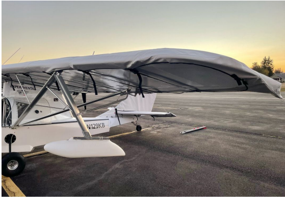
SeaRey Empennage & Wing Covers

WINTER USE MATERIAL - Made with Solution-Dyed Polyester fabric, this option is intended for seasonal use to aid in deicing, rain mitigation, or for occasional travel. The material is lighter and more compact, but more susceptible to UV damage and may have a shorter useful life if used continuously outside than the all-year use material.