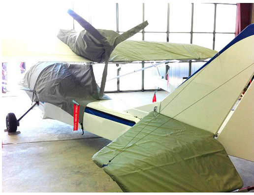
SeaRey Canopy, Engine, Wing & Horizontal Stab. (test fit covers)