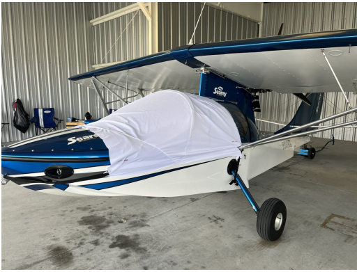
SeaRey Cockpit ONLY Cover, test fit cover