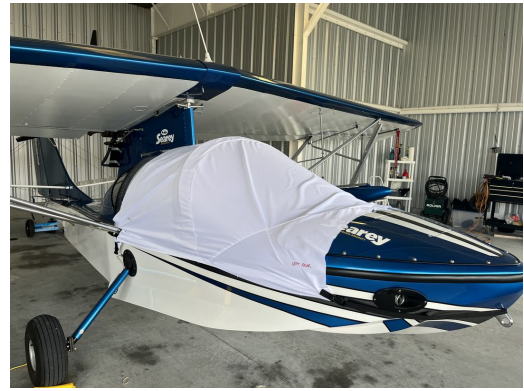
SeaRey Cockpit ONLY Cover, test fit cover