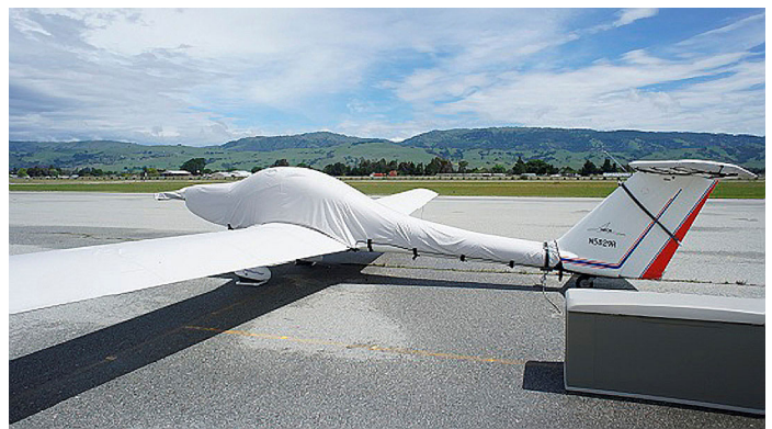
Grob 109 Canopy/Engine w/ extension to tail, Wing, Stabilizer & Prop/Spinner Covers