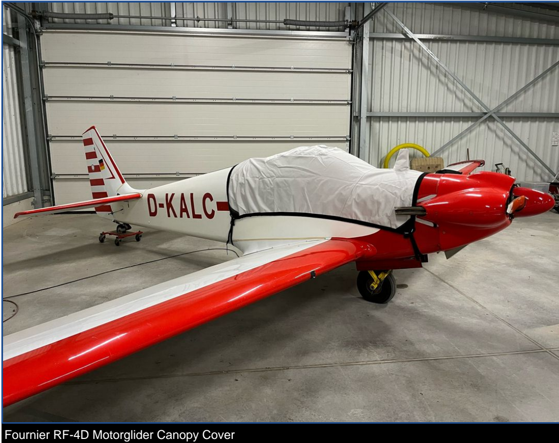
Fournier RF-4D Motorglider Canopy Cover