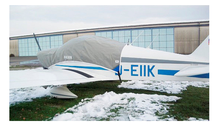
Robin R.2160 Canopy/Engine Cover

Travel Covers are made with Silver Solution-Dyed Polyester fabric and only lined over the windshield to save weight. The material is lightweight and more compact for easy stowage in the aircraft. The polyester material is water resistant, but only intended for occasional use outside. We also have an ultra lightweight material available for fitted hangar dust covers. For daily outdoor use, the non-travel Sunbrella Cover is the best choice.