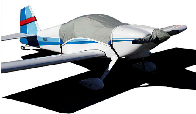
Canopy Cover, Prop Cover

This cover type is made from Silver Acrylic Sunbrella canvas and is 100% lined with a soft and smooth microfiber. Bruce's Custom Covers developed this material combination especially for aircraft protection. The outer material is medium weight and treated for water resistance, UV resistance and anti-static buildup. The inner lining is a very soft and smooth microfiber to prevent scratching. The material is very reflective, and tests show that the cabin interior temperature can be reduced to near-ambient temperature on the hottest of days. It is water, ice and snow repellent, yet breathable to allow moisture to escape from between the cover and the aircraft surface.