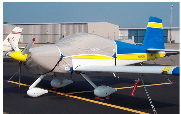
Van's RV-9 Canopy & Engine Covers